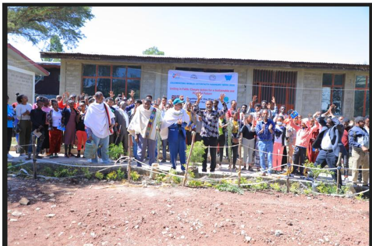
PHOTO: Celebration of #wiHW2025: Community Gathering - Tree Planting and promoting inclusion initiative, Ambo, Feb 2025

Local leaders reflected, “Planting these trees is a lasting memory, reminding us of our responsibility to care for the earth and each other.”