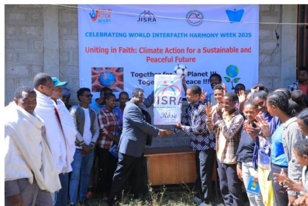
Photo: JISRA presents sports materials to enhance efforts in peacebuilding, teamwork, and inspiring future generations. Ambo Town, April 2024

Ambo's Community Action for Peace stands as a testament to the power of community-driven change . It highlights how shared goals can bridge divides, bringing together diverse community segments and paving the way for future initiatives. @EifdaForyou continues to champion grassroots action, we encourage other communities and organizations to take inspiration from Ambo's example. By joining hands, we can create a future that thrives on sustainability, inclusion, and peaceful coexistence. Stay connected with EIFDDA for more updates and inspiring initiatives!