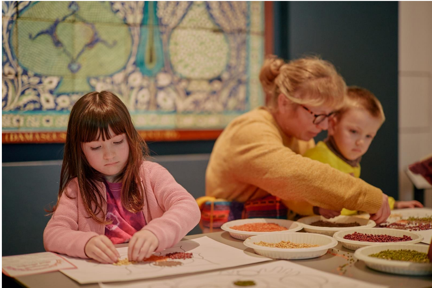
Collaborative Rangoli workshop. Photo 2025

The collaboration between the Ashmolean Museum staff, volunteers, and various cultural and faith-based organisations was central to the festival's impact, each of them bringing their expertise and passion to the event. This year the One World Festival Committee and Partners included: Asylum Welcome, Dialogue Society, MUZIM-Art4Connect, Christ Church Cathedral, Oxford Civic Society, Oxford Council of Faiths, Oxford Hindu Temple and Community Centre Project, Oxford Interfaith Forum, Oxford Jewish Congregation and The Oxford Foundation.