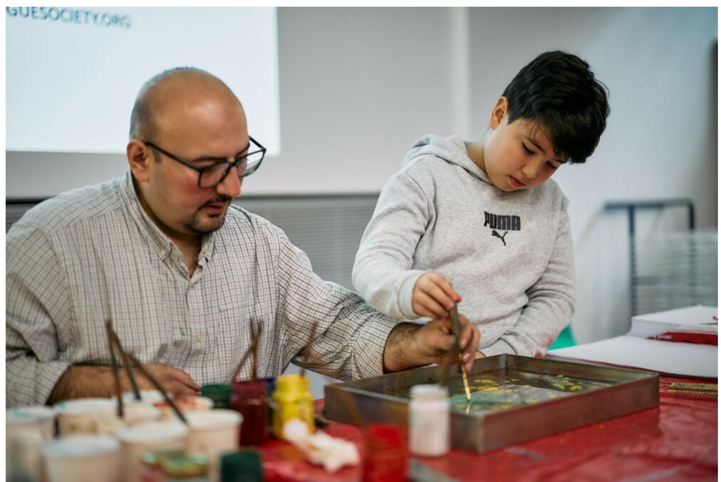
Turkish water marbling returned for the event this year. Photo 2024

'I want to express our profound gratitude for providing such a fantastic platform for our community to share its cultural heritage through the Youth Forum, Fashion Show, Traditional Dancing, and Classics session. The Chinese community greatly appreciated the opportunity to perform at the Ashmolean.'