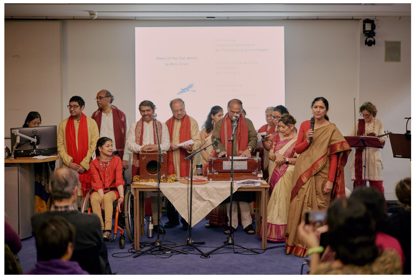
Unity in Diversity, A performance celebrating Bengali culture with music, dance, and poetry. Photo 2025

'Essential to have an international and multicultural outlook in a world of growing intolerance. Well set up for the whole family.'