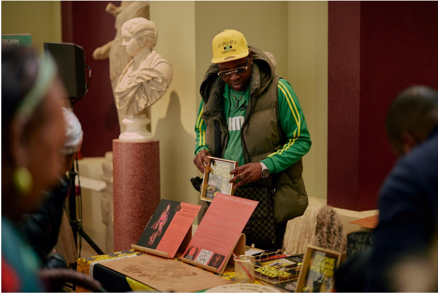
Open Africa. Celebrating African identity and heritage with AFiUK. Photo 2025