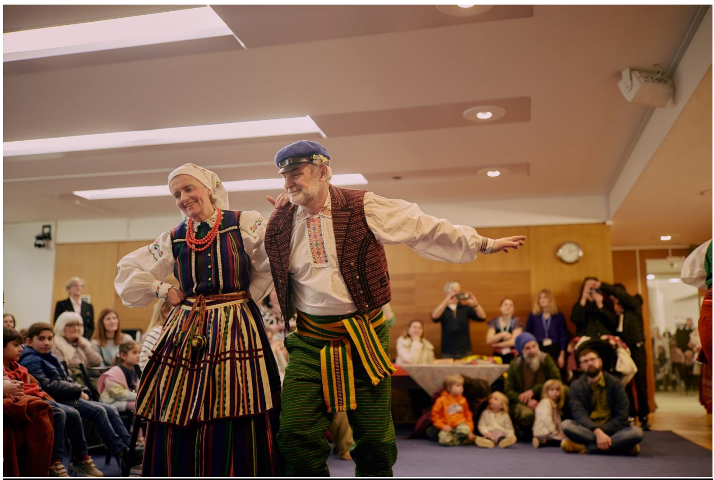
Families watch activities as part of a Taste of Poland. Photo 2025