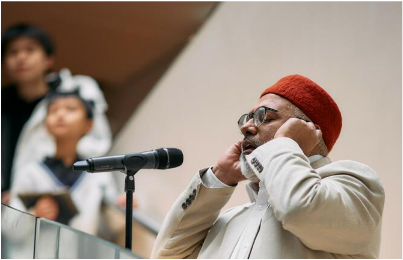
Adhan, Islamic Call to Prayer captures audience in a prominent space in the Museum. Photo 2024

Over the weekend, we were thrilled to welcome 12,607 visitors to the Museum. On Saturday, we welcomed 7,939 visitors and on Sunday, 4,668. This marks a 34.5% increase from last year's event. It was truly joyful to see so many families enjoying and engaging in the One World activities. Each year has seen key religions take pride of place to conduct bell ringing, Jewish melodic prayers, Hindu Invocations and Adhan, Islamic Call to Prayer.