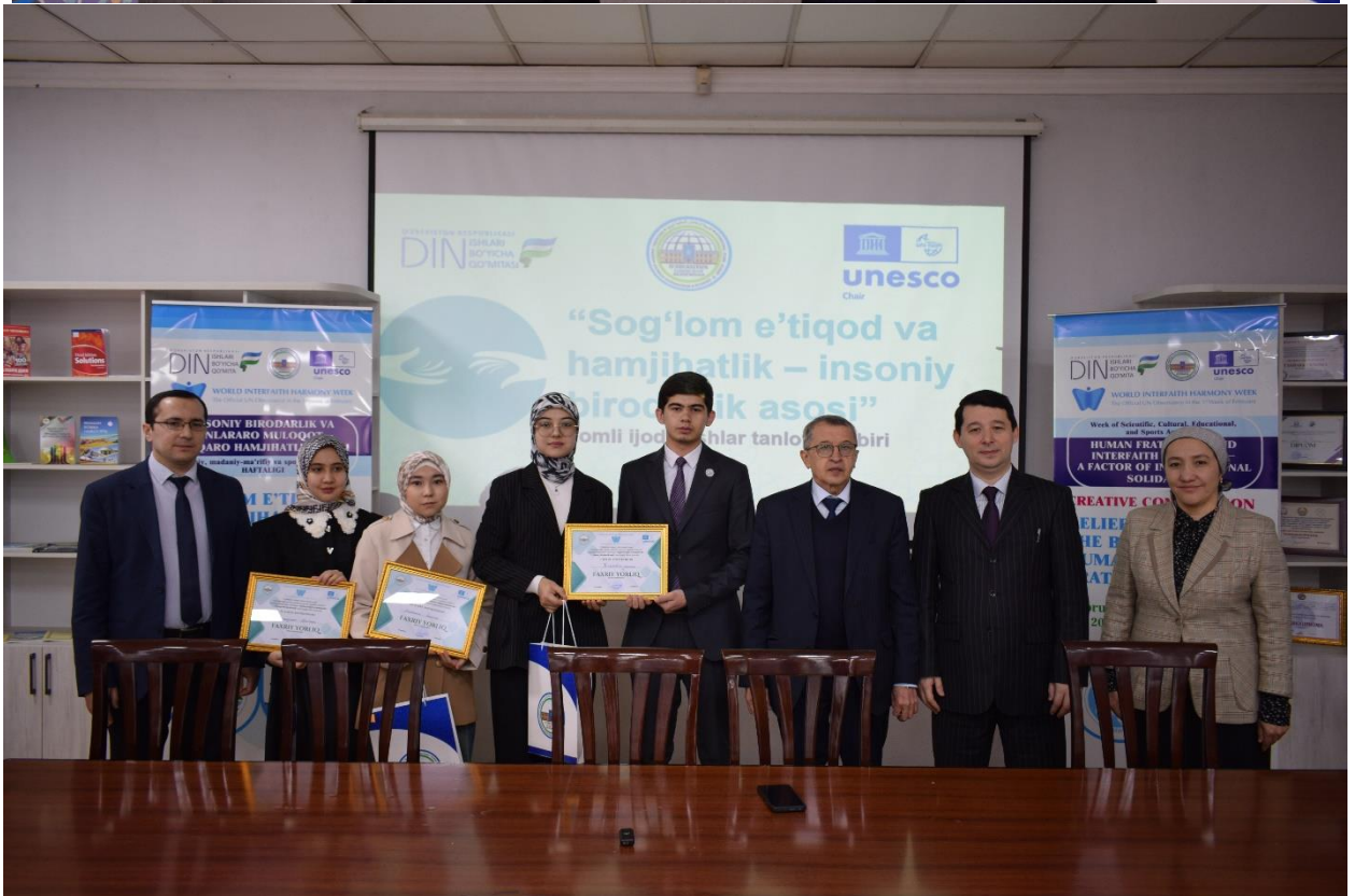
Award Ceremony Honoring Winners – Organizers present certificates and prizes to outstanding participants, recognizing their efforts in promoting dialogue, understanding, and peace through creative expression.