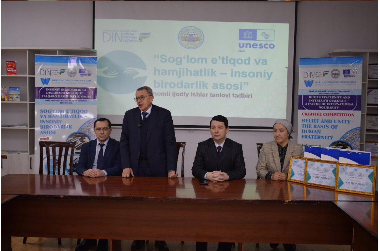
Judging Panel Evaluating Entries – A panel of experts attentively reviews each project, discussing the depth of storytelling, creativity, and the impact of the presented messages.