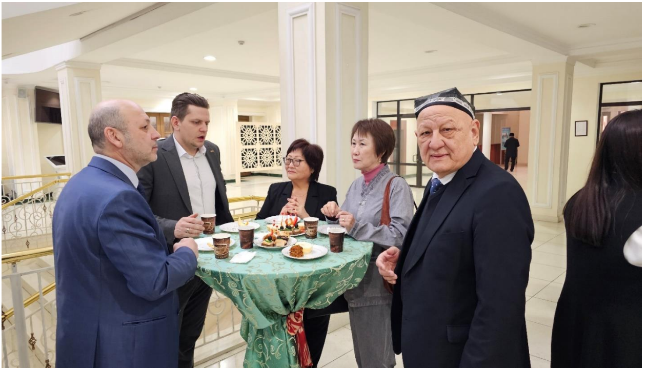
Bridging Beliefs – Religious and community leaders share insights over a common table, highlighting the power of interfaith cooperation