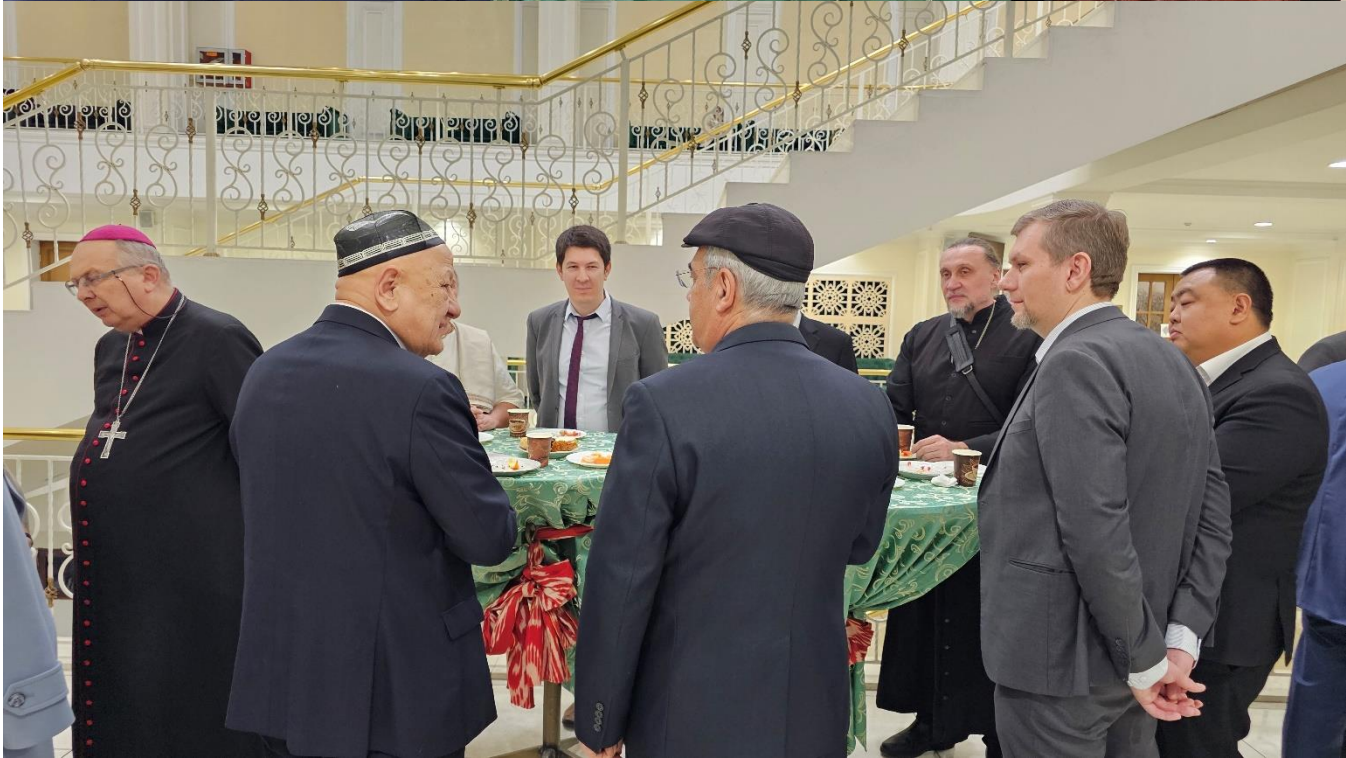
Harmony in Conversation – The gathering creates a welcoming space for open discussions, promoting interfaith solidarity.