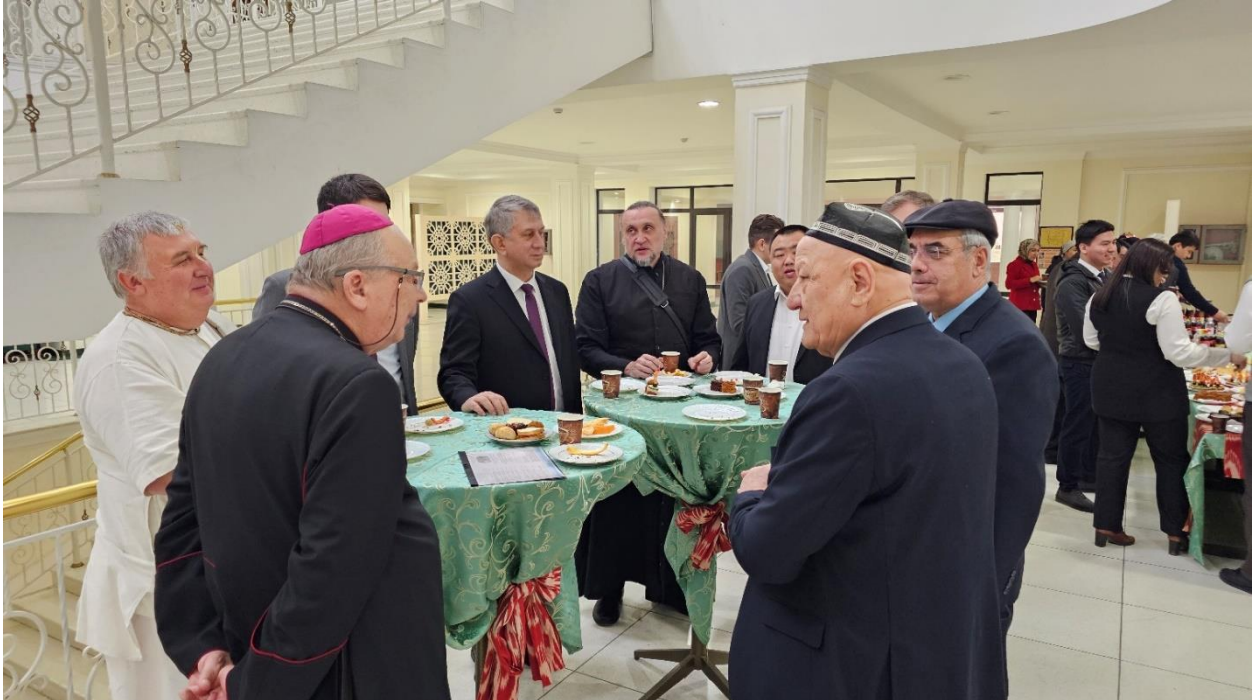
A Table of Unity – Representatives from diverse faith traditions engage in meaningful dialogue, fostering mutual respect and understanding.