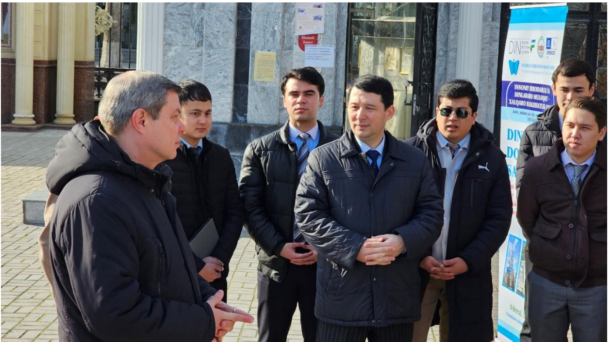
Engaging with Orthodox Traditions – A moment of dialogue with church representatives, deepening understanding of Orthodox rituals and community life.