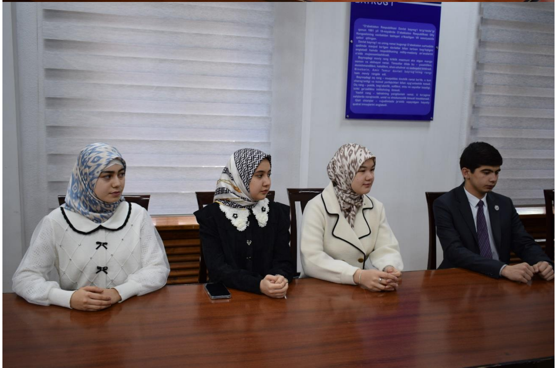
Diverse and Talented Participants – The competition brought together students and young creatives from various universities and cultural backgrounds, each contributing unique perspectives on interfaith unity and human fraternity.