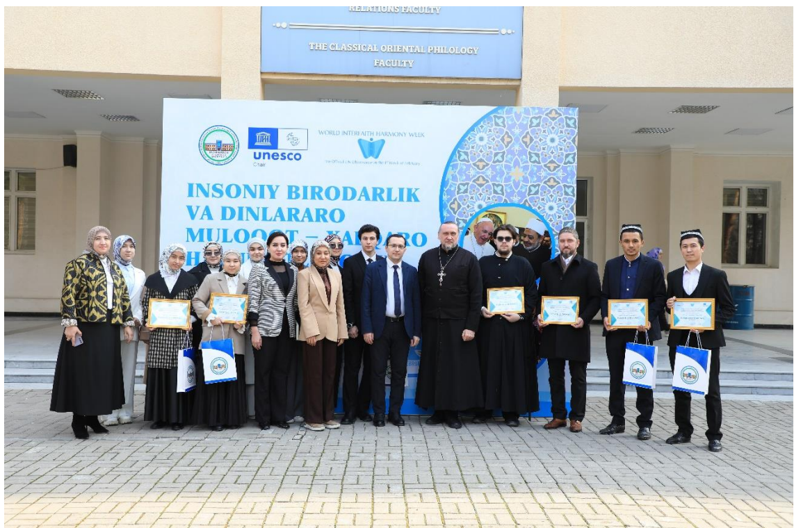
At the conclusion of the conference, the lecturers and speakers gathered for a commemorative photo, marking the successful exchange of knowledge and ideas. Their collective contribution highlighted the importance of academic discussions in fostering interfaith understanding and religious tolerance.