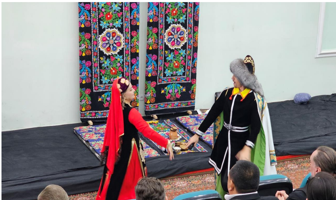
Traditional Performance – Artists showcase Uzbekistan’s multicultural heritage through music and dance, symbolizing harmony and shared traditions.