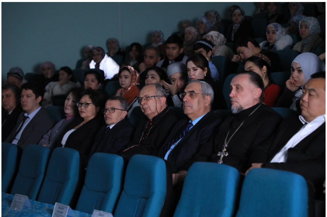
Unforgettable Moments – The auditorium was filled with raw emotion as the story deeply touched the hearts of viewers.