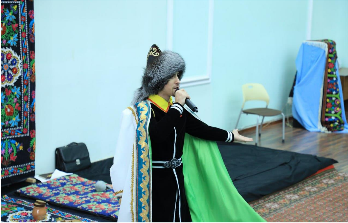
A member of the Bashkir National Cultural Center captivated the audience with a vibrant performance of traditional music and dance, celebrating cultural heritage and unity.