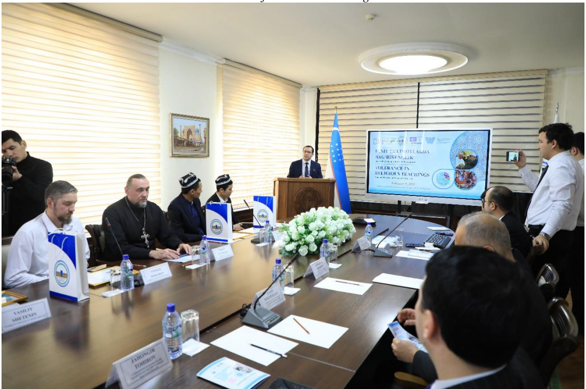
Engaging Dialogue – A vibrant exchange of ideas takes place as students explore the role of tolerance in different religious traditions