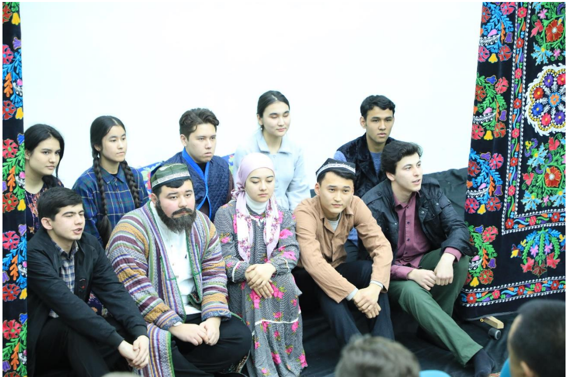
A Scene of Reflection – Every expression and gesture conveys the depth of emotion behind "You Are Not Orphaned."