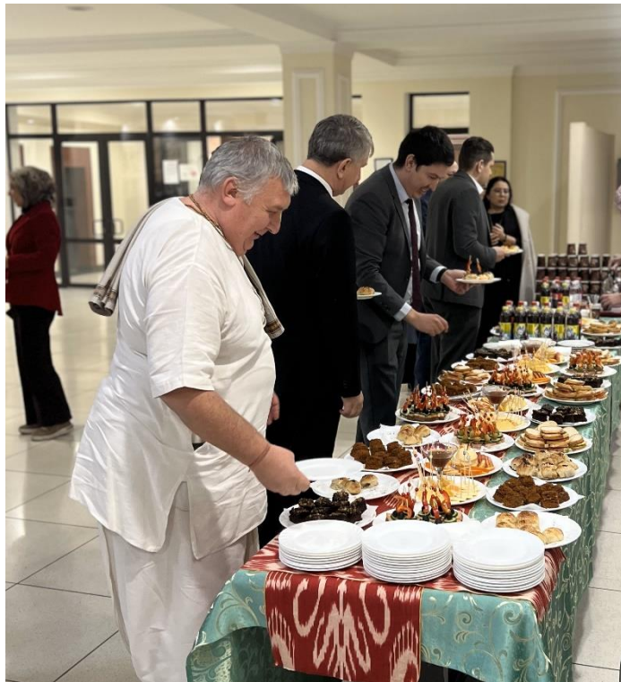
Faith leaders come together at the table, embracing dialogue and cultural exchange through a shared dining experience.