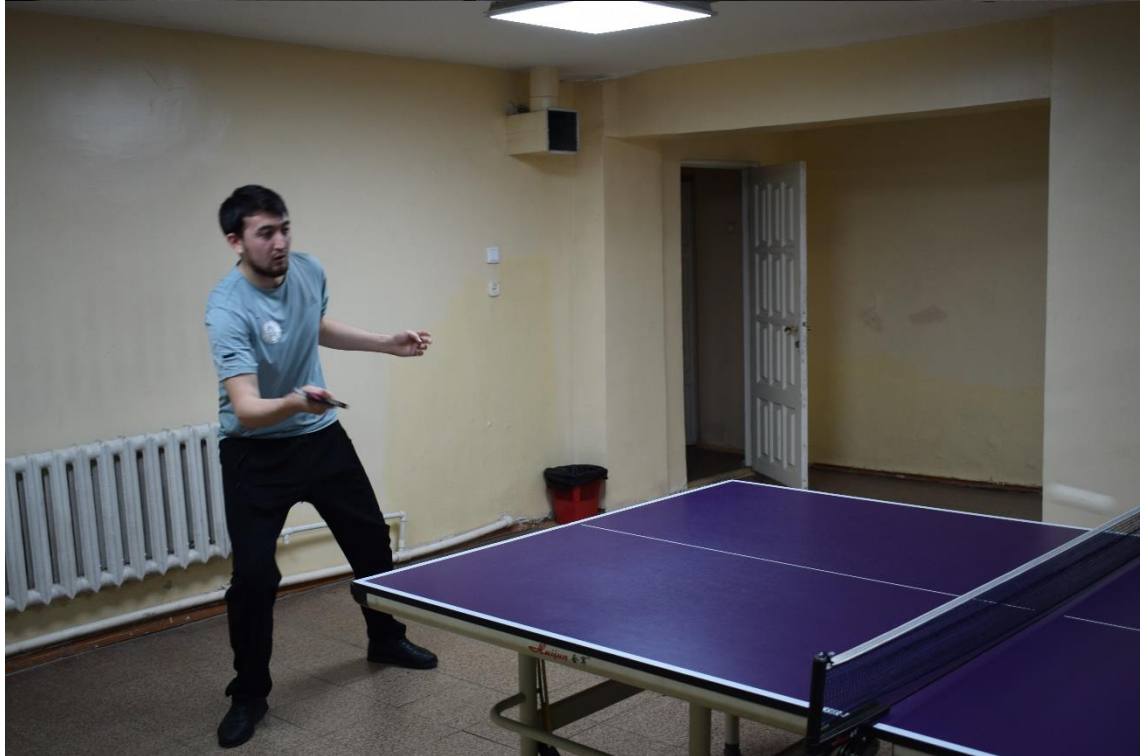
Fast-Paced Action – A Game of Precision. A dynamic moment captured as the ball speeds across the table, with participants reacting swiftly, displaying agility, precision, and sportsmanship.