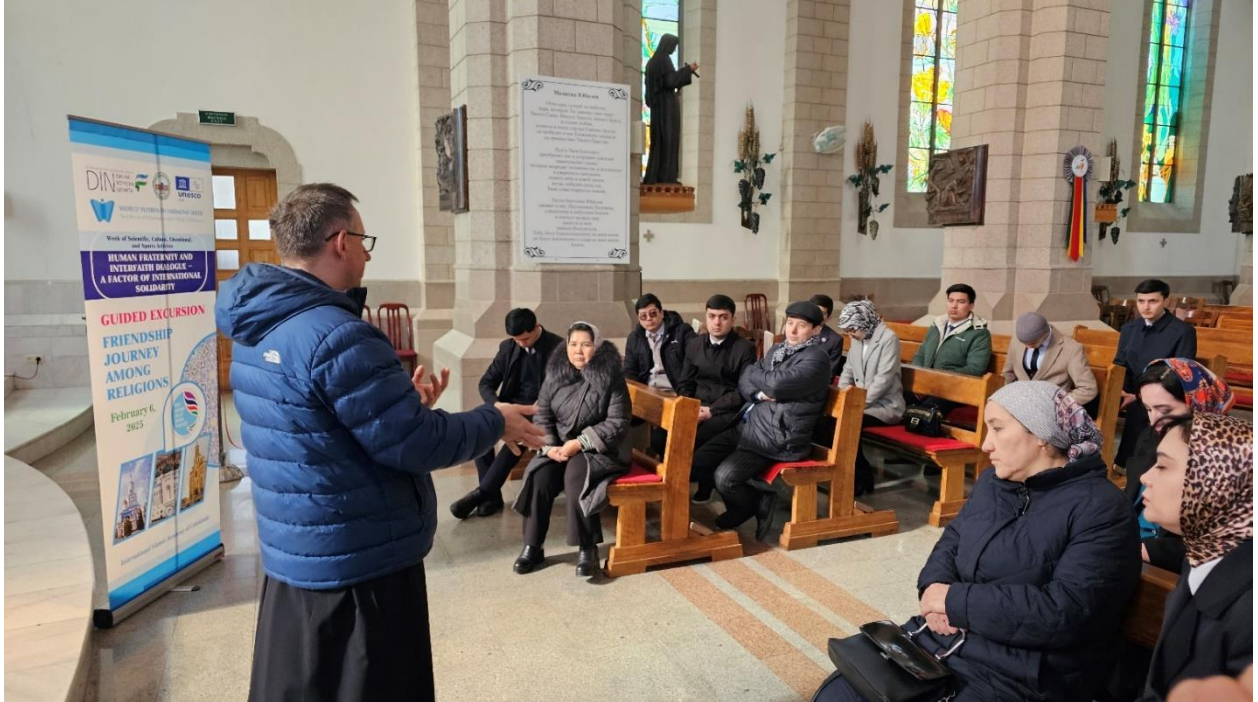
Exploring Sacred Traditions – Participants learned about Catholic rituals, liturgical practices, and the Church's role in fostering interfaith dialogue in Uzbekistan.