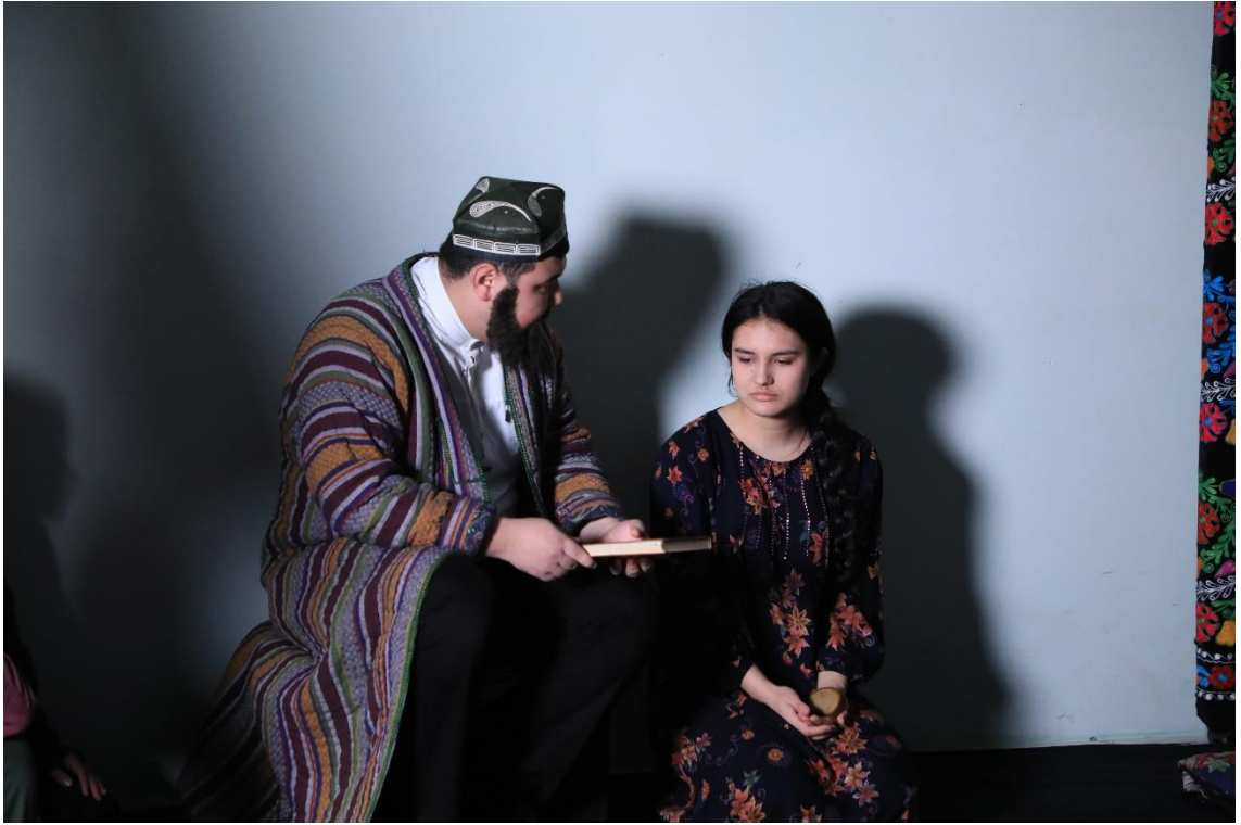
The stage becomes a window into history, reminding viewers of the play's timeless social message.