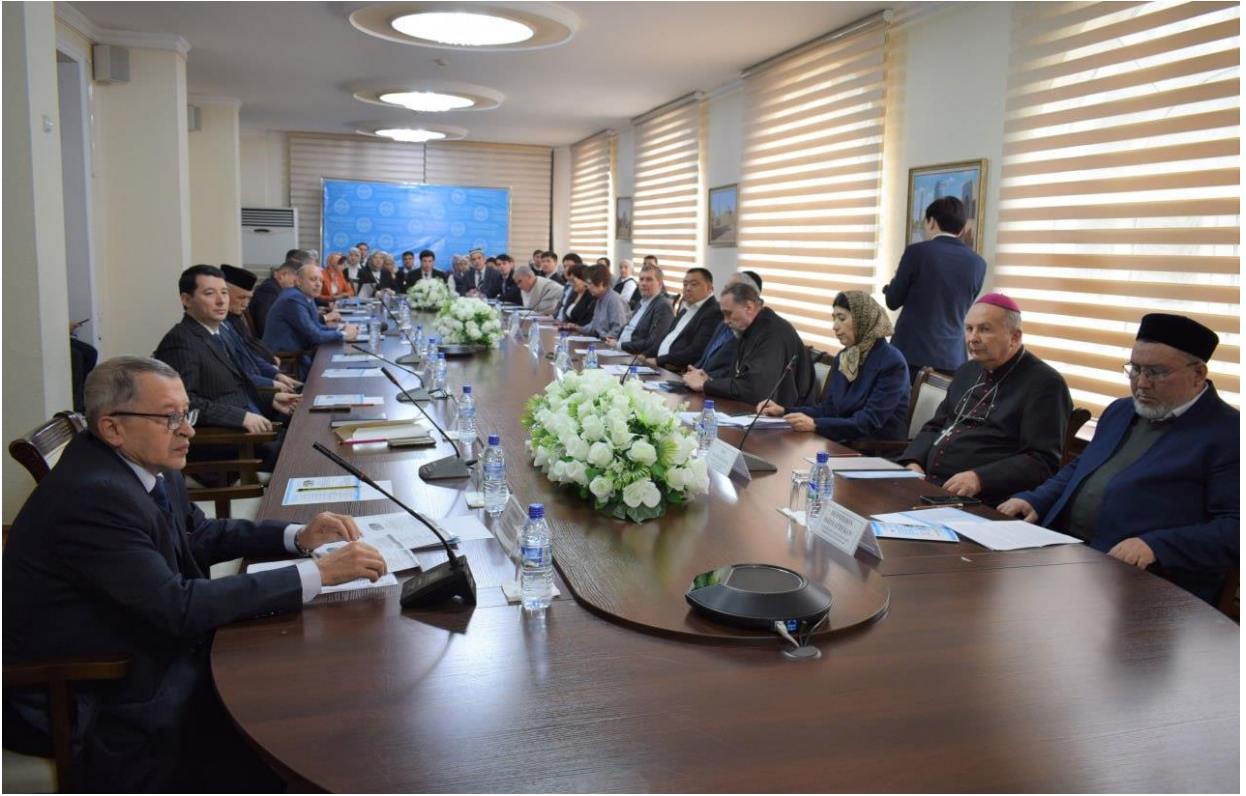
A historic gathering of scholars, religious leaders, and experts at the International Scientific-Practical Seminar on Interfaith Dialogue and Solidarity. This seminar brought together diverse perspectives to foster global peace and mutual understanding.