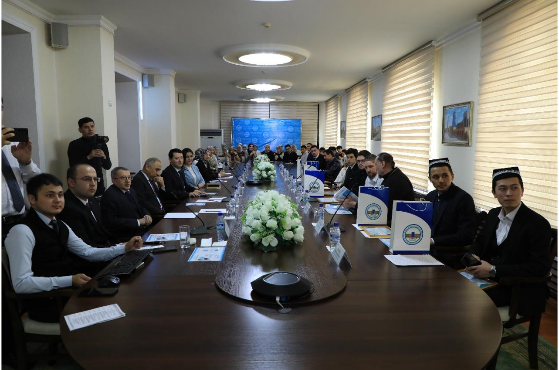
Young Scholars in Action – Students present their research on religious tolerance, fostering academic discussion and interfaith understanding.