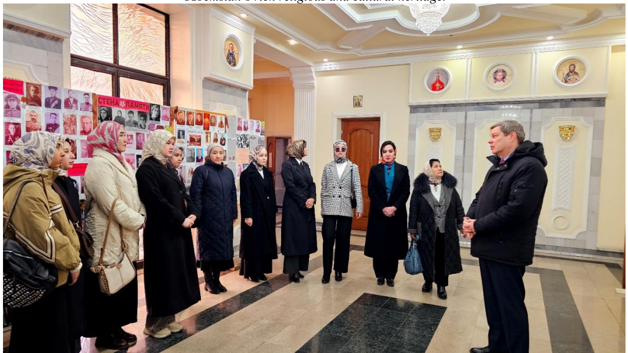
Attendees observe sacred icons and liturgical elements, reflecting on the deep-rooted presence of Christianity in the region.