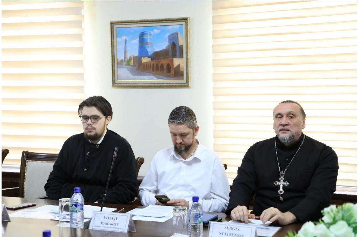
A dynamic exchange of ideas unfolds as young scholars explore the role of tolerance in religious teachings. Through presentations and open discussions, students deepen their understanding of interfaith relations and the importance of respect for diverse beliefs.