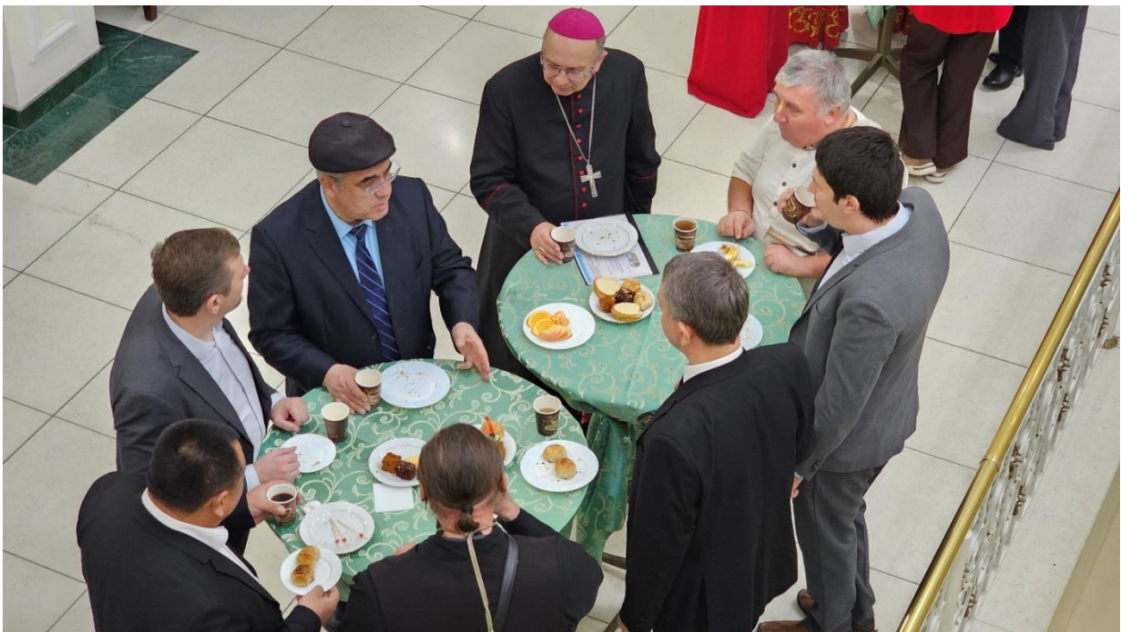
Shared Traditions – Participants exchange cultural and religious perspectives, strengthening bonds of friendship and unity