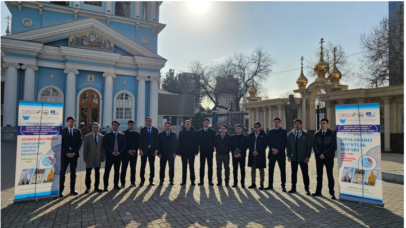
A group photo in front of the church, symbolizing mutual respect among different faith traditions.