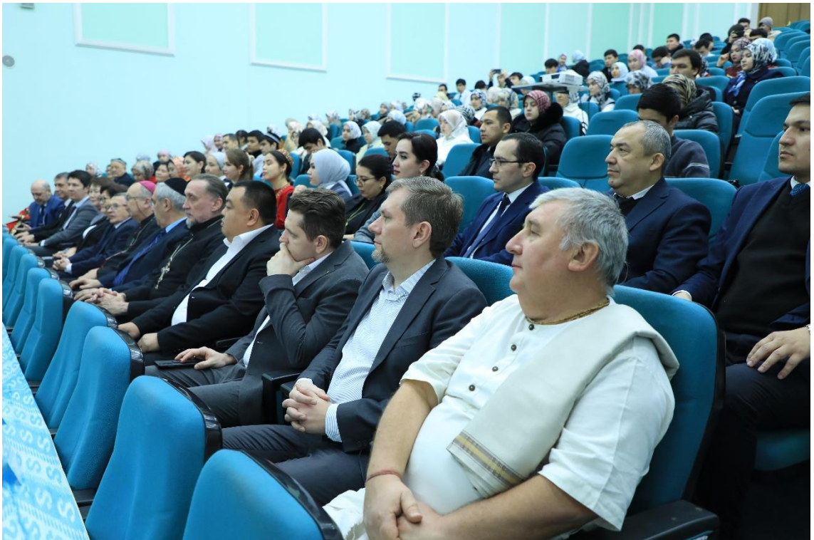
Captivated Viewers – The auditorium is filled with students, faculty, and guests deeply moved by the performance.