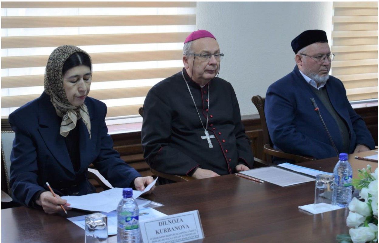
Distinguished representatives from various religious communities participate in the International Scientific-Practical Seminar on Interfaith Dialogue and Solidarity.