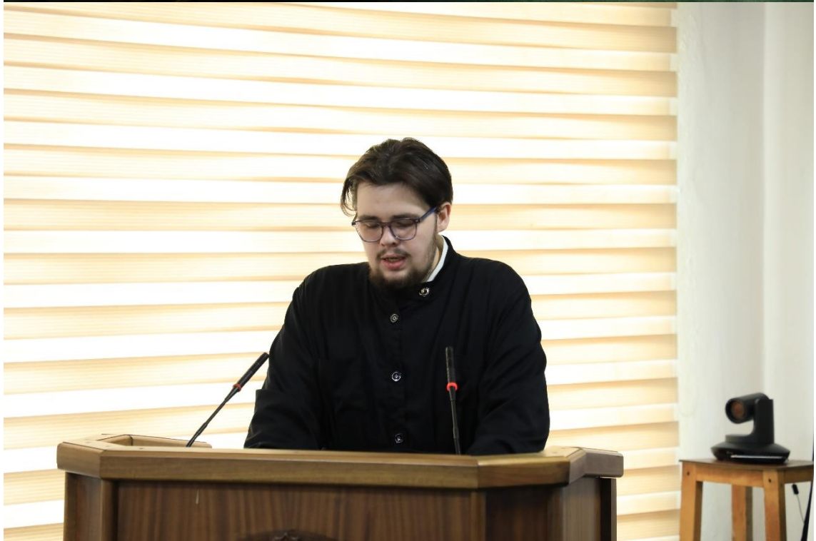
Engaged Discussion – Students from various academic and religious institutions, including the Imam Bukhari Tashkent Islamic Institute and the Tashkent Orthodox Seminary, actively participate in discussions on tolerance and interfaith dialogue. The exchange of perspectives highlights the significance of education in fostering mutual understanding and cooperation.