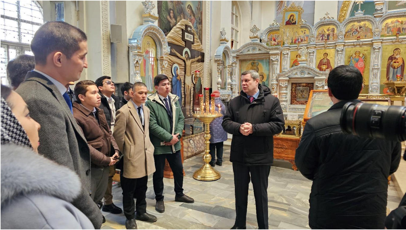
Participants step inside the beautifully adorned church, surrounded by intricate icons, frescoes, and religious artifacts that reflect centuries of Orthodox Christian heritage.