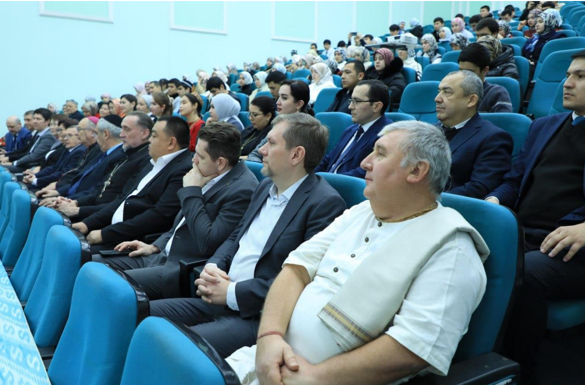
The participants enthusiastically engaged, embracing the spirit of cultural diversity and interfaith harmony.