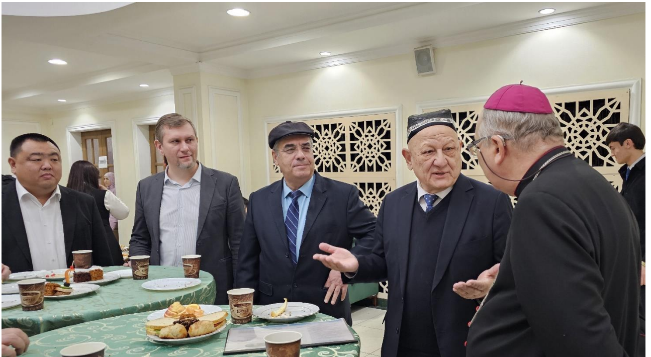
Breaking Barriers – Over a shared meal, attendees connect beyond differences, emphasizing shared values and mutual respect.