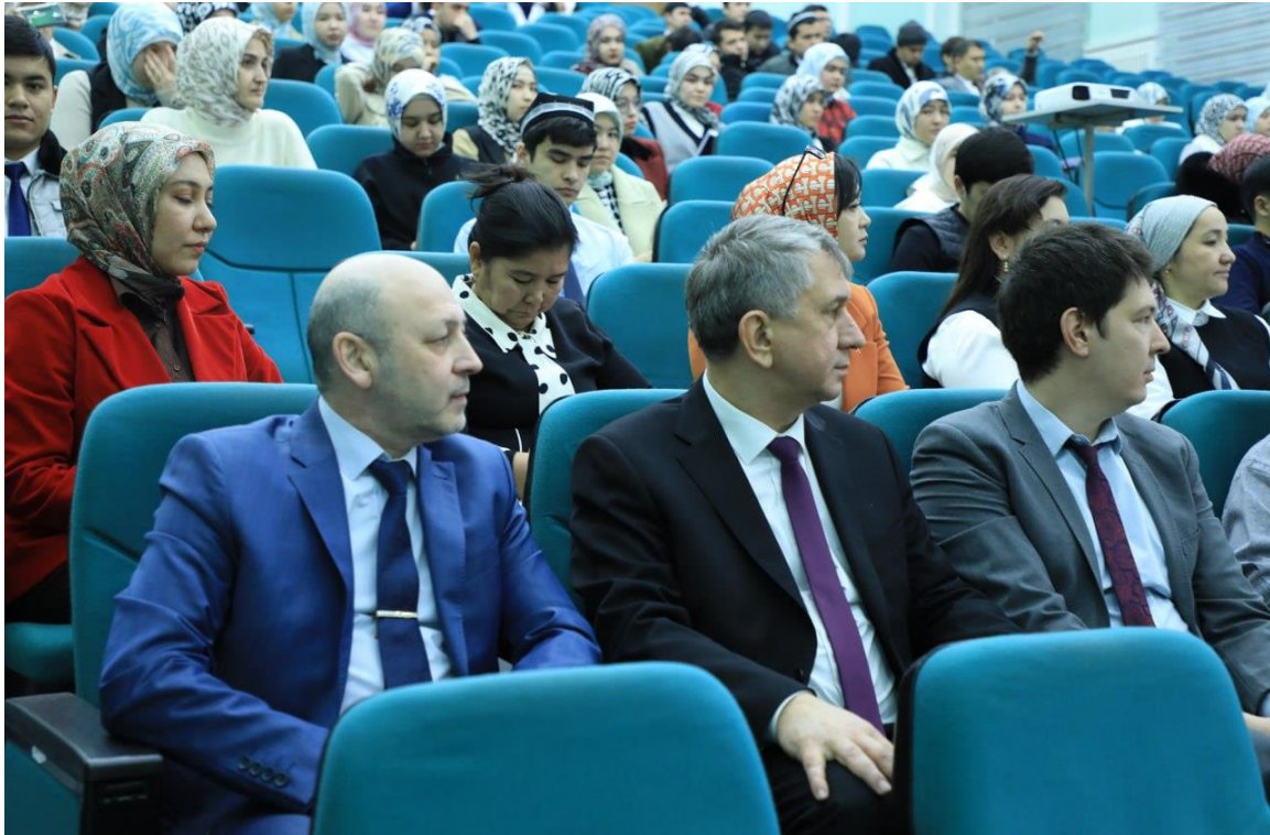
The attendees, encompassing various cultural and religious traditions, actively participated, demonstrating a collective dedication to interfaith unity and mutual understanding.