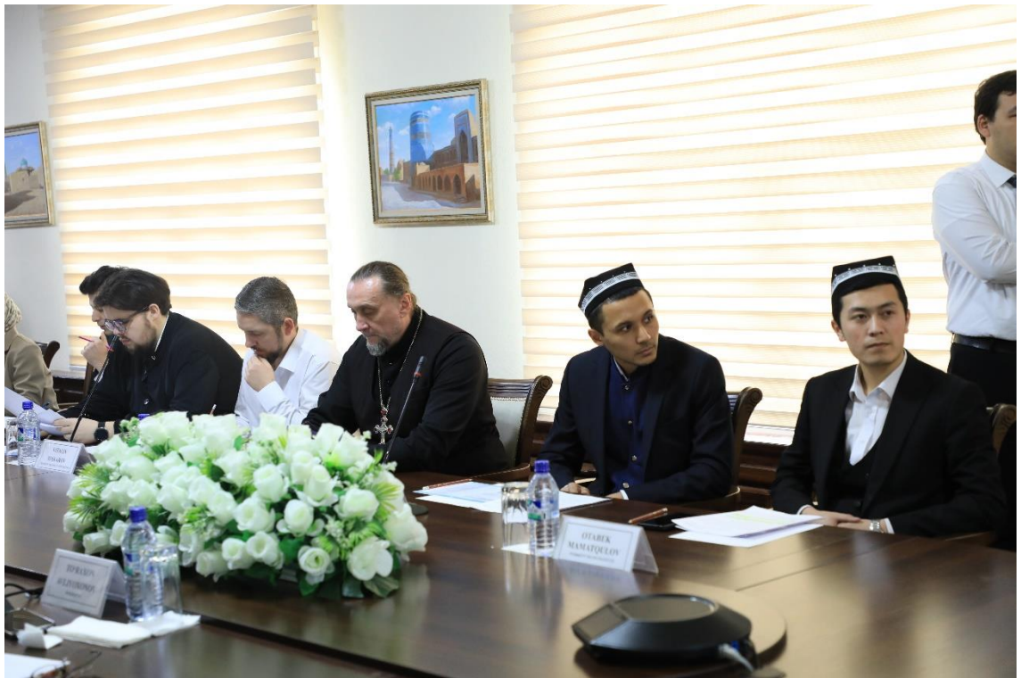
A moment of thoughtful reflection as students representing different faith traditions present their research on religious tolerance. The conference serves as a platform for exploring shared values and addressing challenges in interfaith dialogue, reinforcing the principles of peace and coexistence.