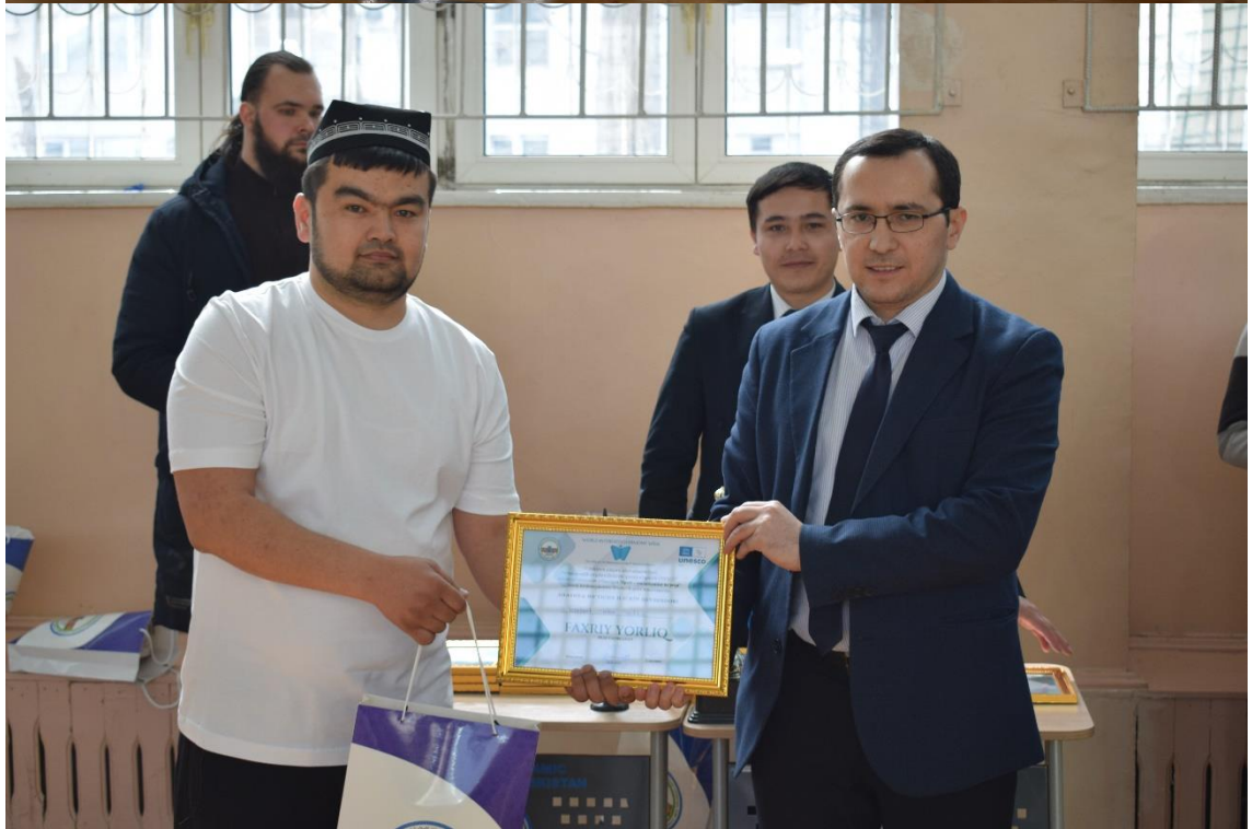
Victory and Recognition – A Celebration of Participation The winners receive medals and certificates, while all participants are acknowledged for their enthusiasm and contribution to fostering unity through sports.