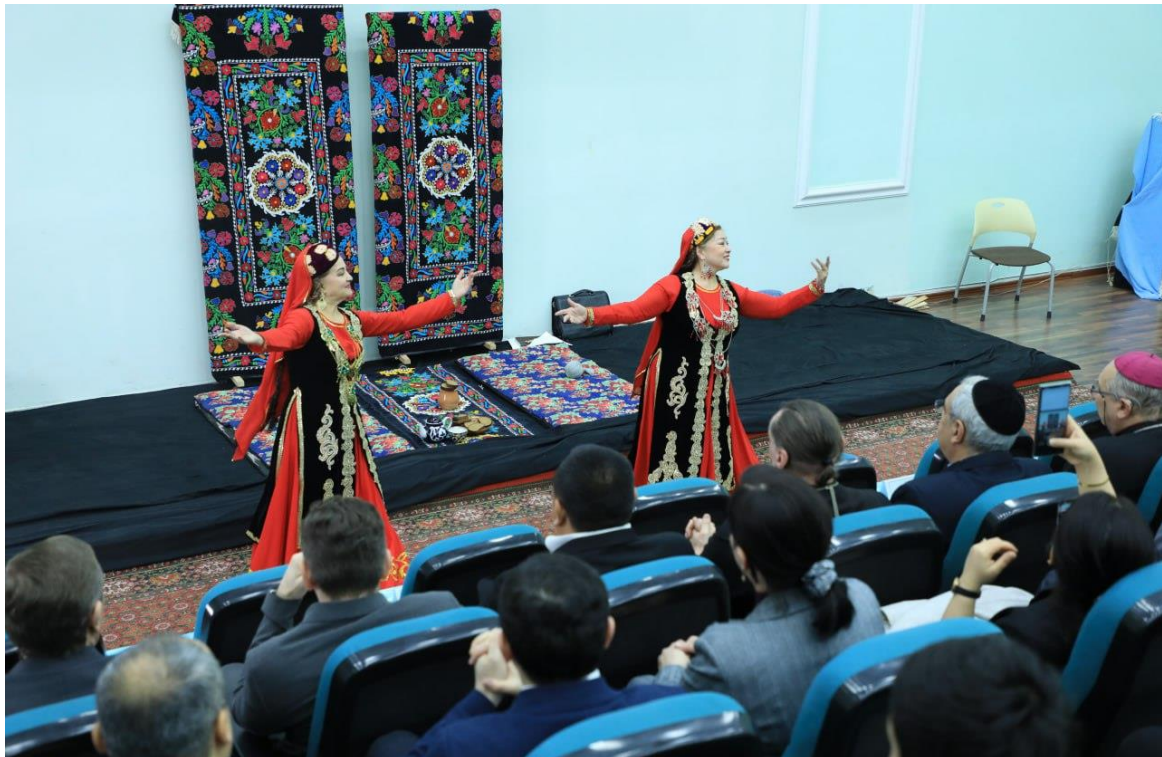
The celebration continued with uplifting performances by members of the Uyghur National Cultural Center, showcasing their rich traditions through music and dance, symbolizing unity in diversity.