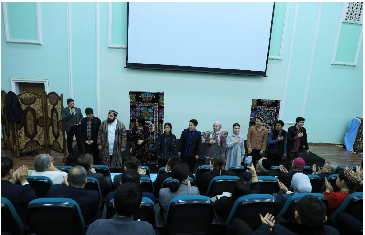
Dramatic Performance – The cast skillfully reenacts scenes from the classic tale, immersing the audience in its profound message.