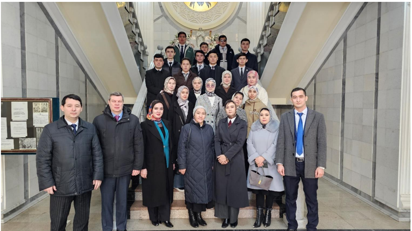
The visit provides an understanding of the Diocese's role in preserving Orthodox traditions and its contribution to Uzbekistan's religious landscape.