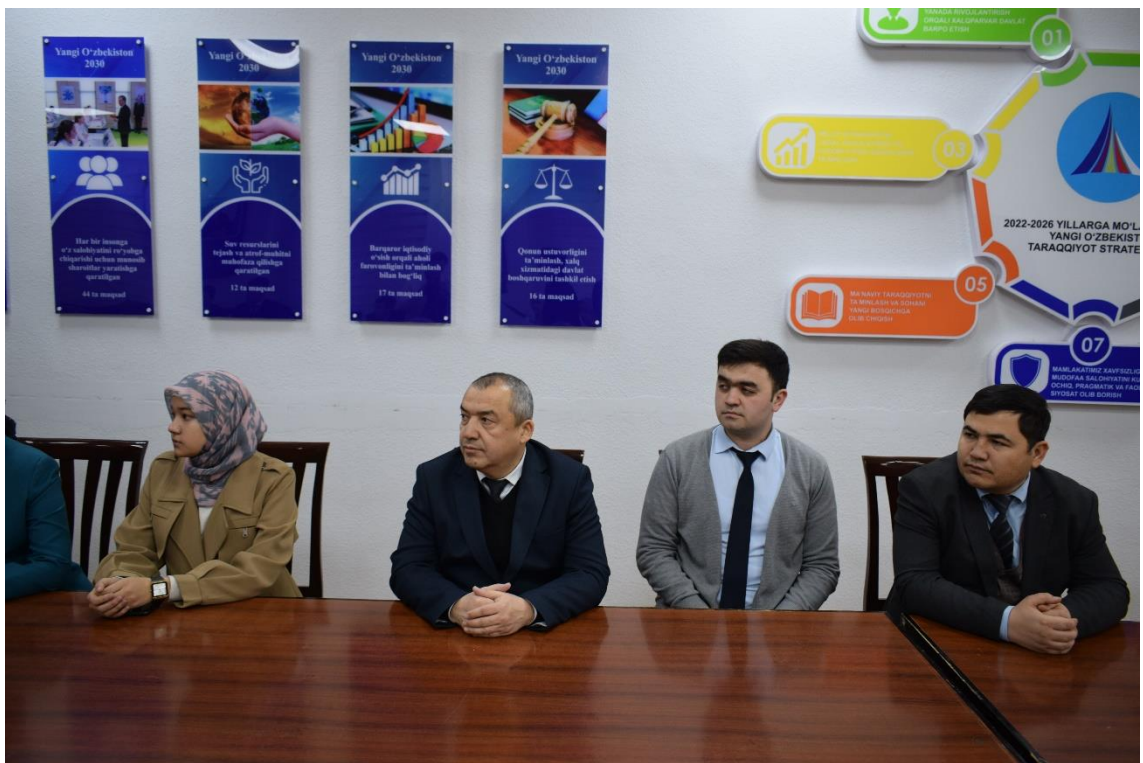
Many participants were passionate about storytelling and social change, using their creative talents to highlight the importance of tolerance, respect, and mutual understanding.