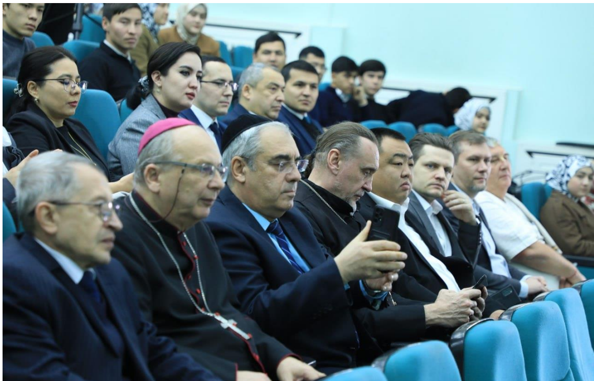
The audience, representing diverse cultural and religious backgrounds, engaged enthusiastically, reflecting a shared commitment to interfaith harmony and cultural appreciation.