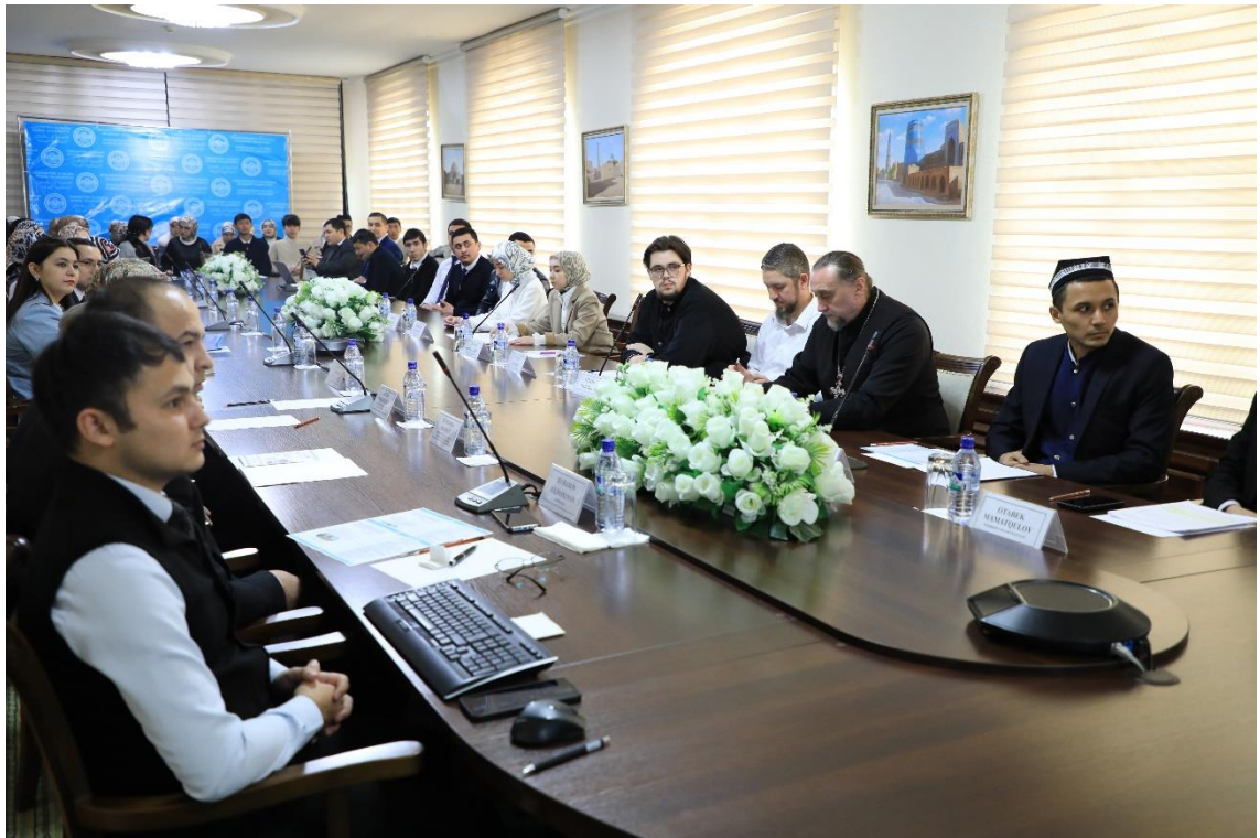
Inclusive Dialogue – A student-led panel discussion features representatives from different faith communities, each contributing their insights on religious harmony. The conference underscores the role of youth in shaping a future built on mutual respect, interfaith cooperation, and peaceful coexistence.