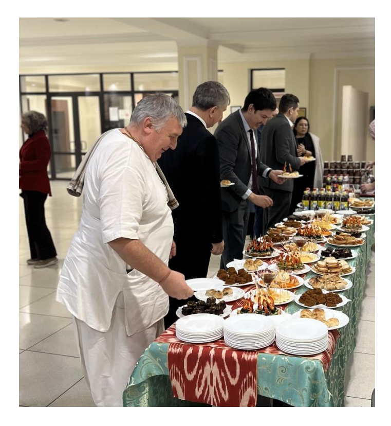
Faith leaders come together at the table, embracing dialogue and cultural exchange through a shared dining experience.