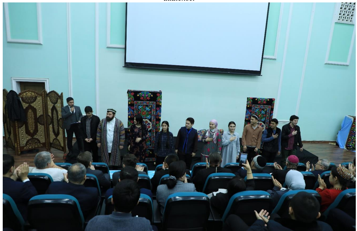
Dramatic Performance – The cast skillfully reenacts scenes from the classic tale, immersing the audience in its profound message.