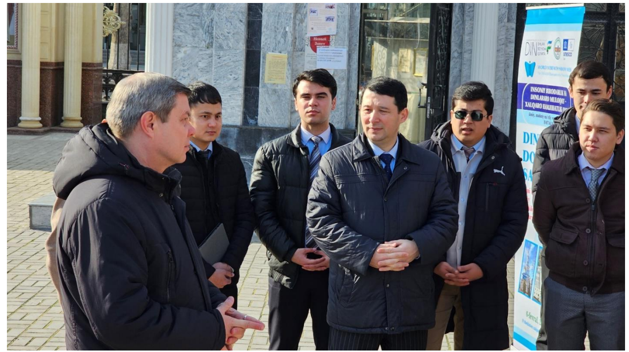
Engaging with Orthodox Traditions – A moment of dialogue with church representatives, deepening understanding of Orthodox rituals and community life.