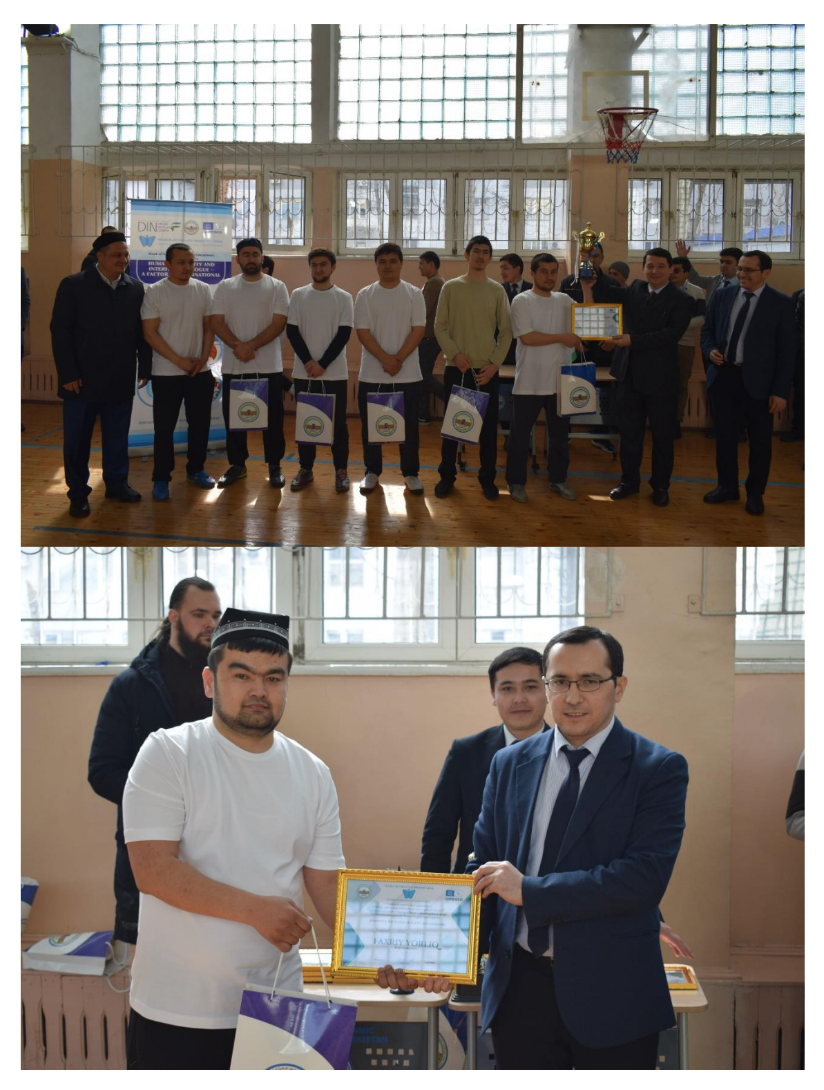
Victory and Recognition – A Celebration of Participation The winners receive medals and certificates, while all participants are acknowledged for their enthusiasm and contribution to fostering unity through sports.