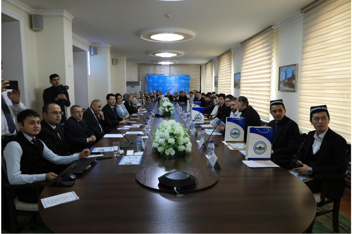
Young Scholars in Action – Students present their research on religious tolerance, fostering academic discussion and interfaith understanding.