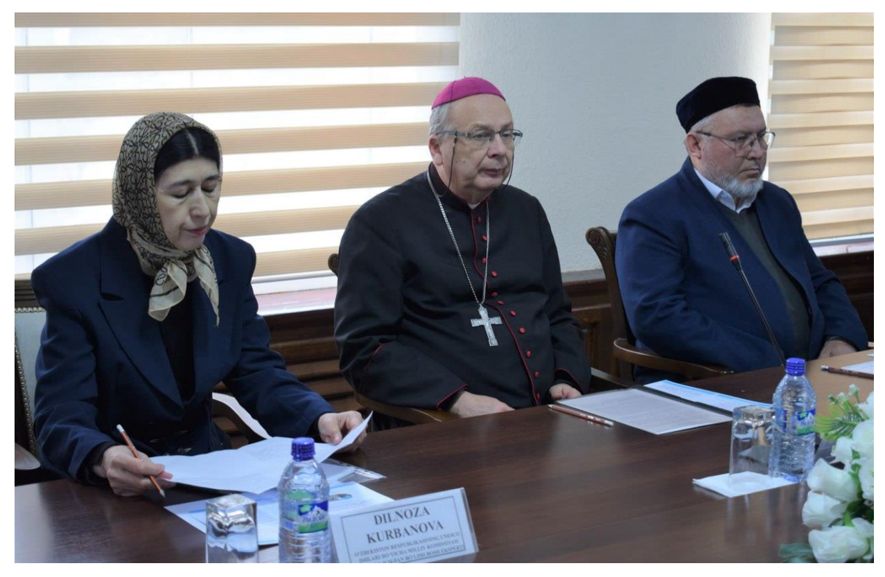
Distinguished representatives from various religious communities participate in the International Scientific-Practical Seminar on Interfaith Dialogue and Solidarity.