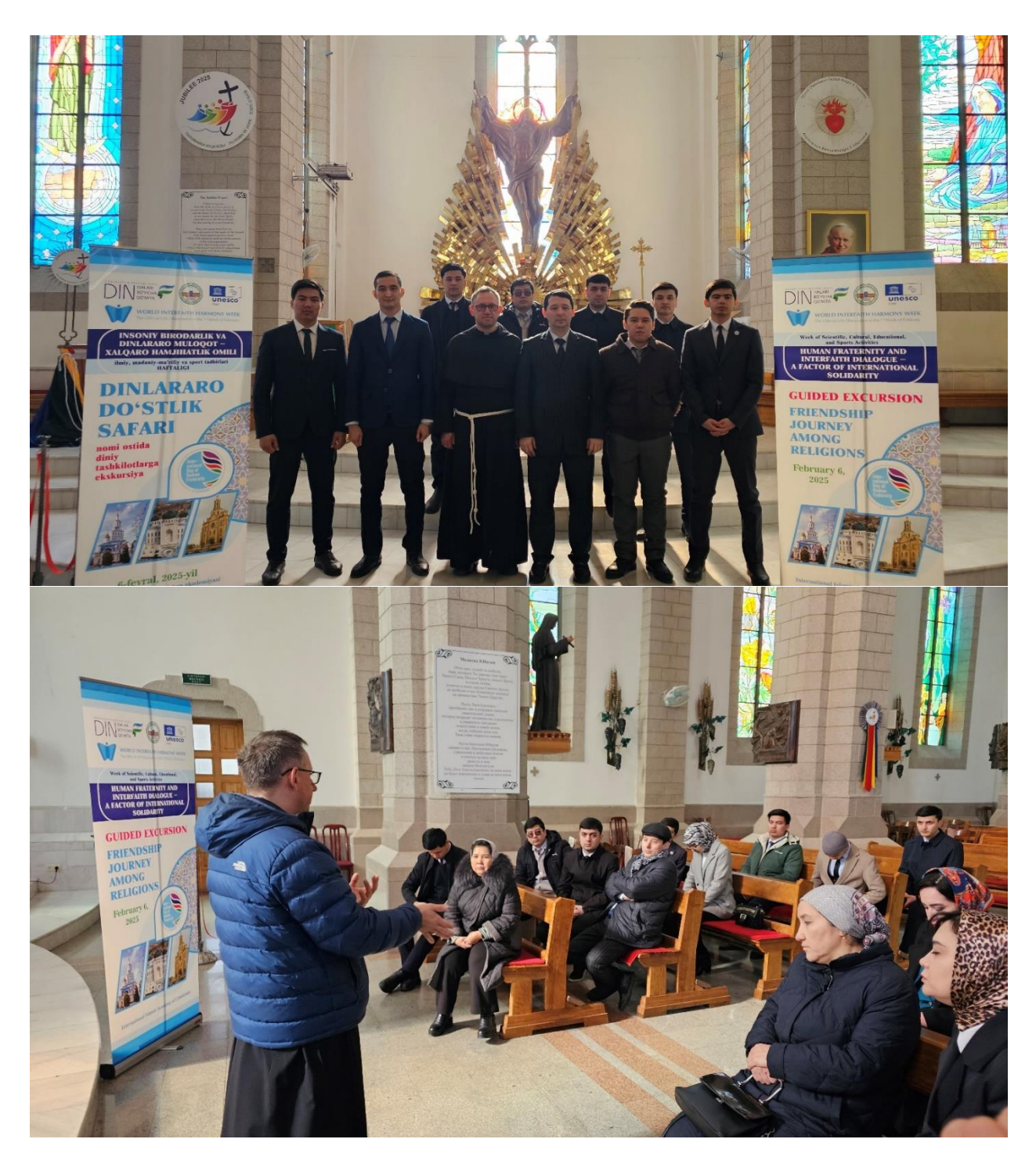
Exploring Sacred Traditions – Participants learned about Catholic rituals, liturgical practices, and the Church's role in fostering interfaith dialogue in Uzbekistan.