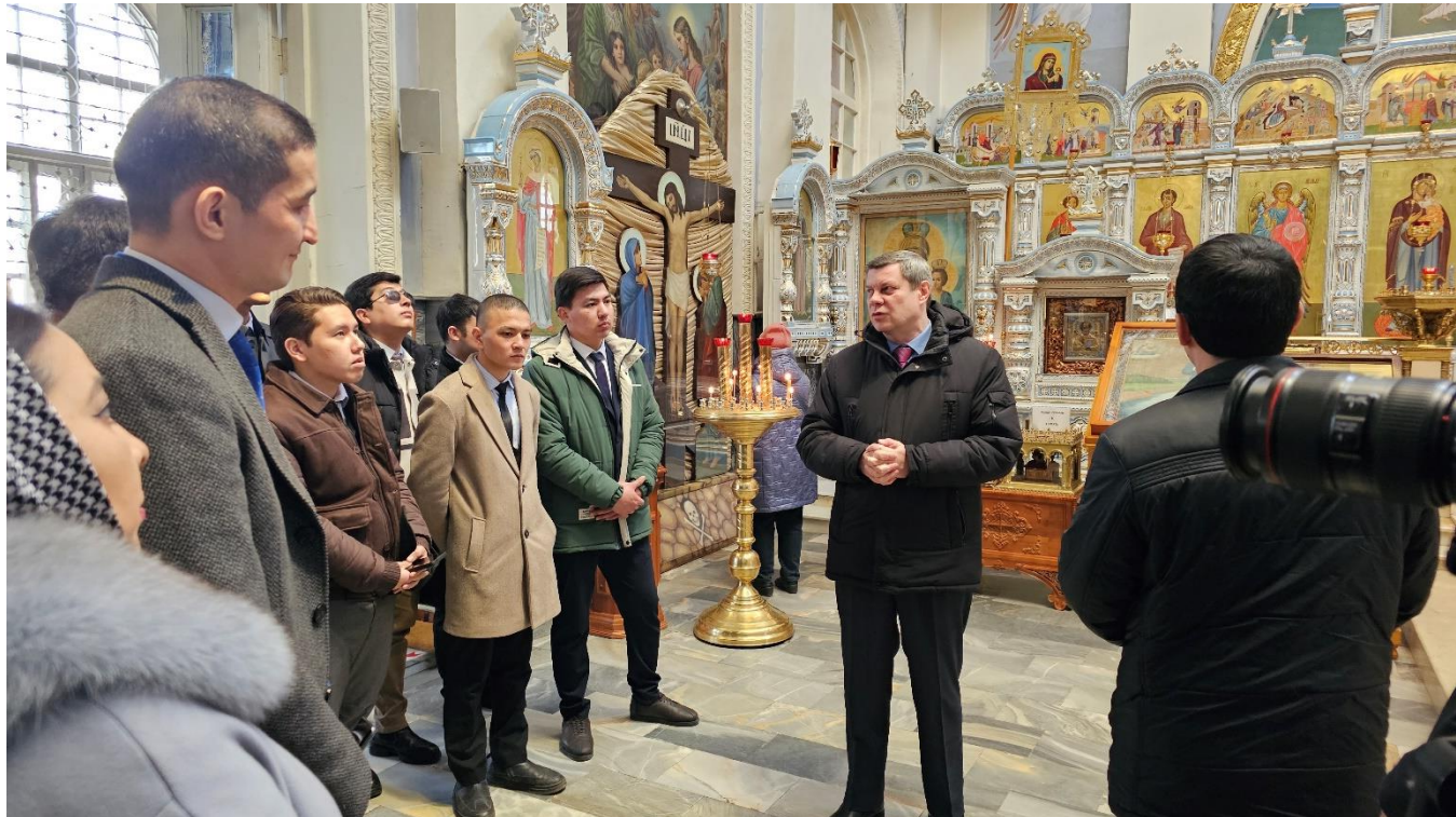
Participants step inside the beautifully adorned church, surrounded by intricate icons, frescoes, and religious artifacts that reflect centuries of Orthodox Christian heritage.