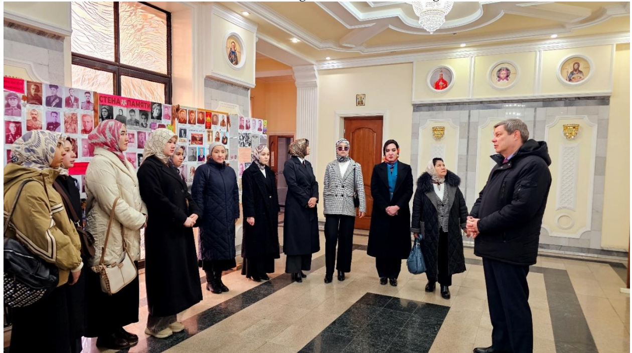
Attendees observe sacred icons and liturgical elements, reflecting on the deep-rooted presence of Christianity in the region.