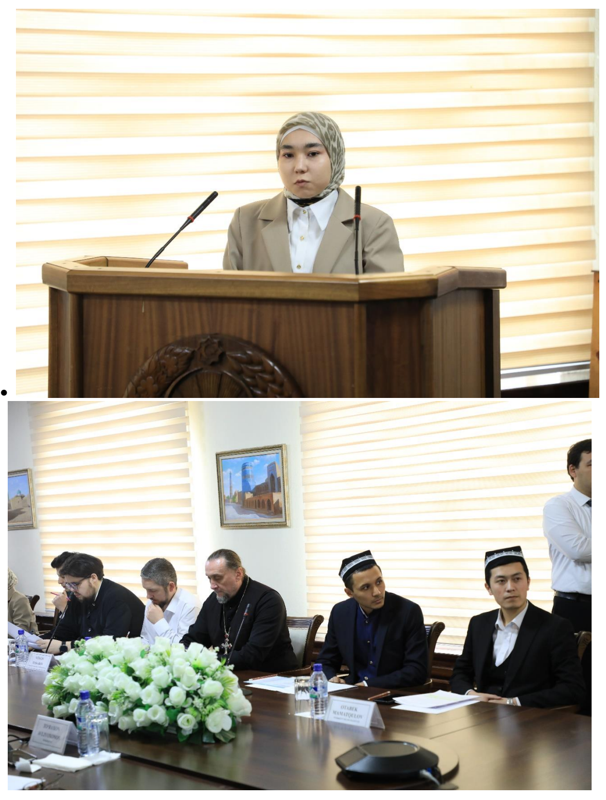
A moment of thoughtful reflection as students representing different faith traditions present their research on religious tolerance. The conference serves as a platform for exploring shared values and addressing challenges in interfaith dialogue, reinforcing the principles of peace and coexistence.