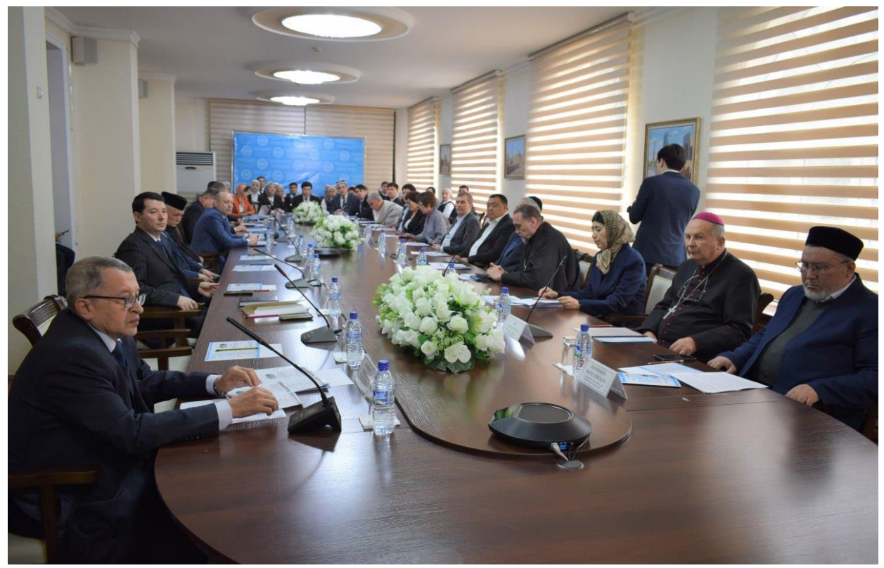
A historic gathering of scholars, religious leaders, and experts at the International Scientific-Practical Seminar on Interfaith Dialogue and Solidarity. This seminar brought together diverse perspectives to foster global peace and mutual understanding.