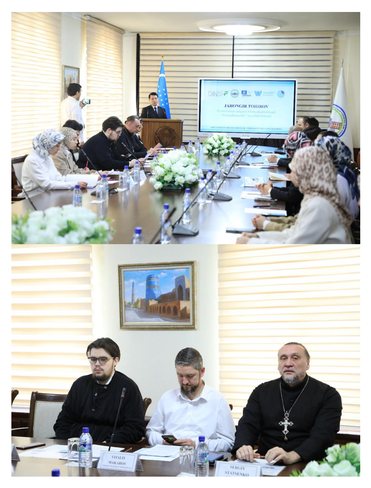
A dynamic exchange of ideas unfolds as young scholars explore the role of tolerance in religious teachings. Through presentations and open discussions, students deepen their understanding of interfaith relations and the importance of respect for diverse beliefs.