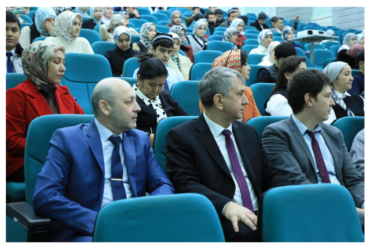
The attendees, encompassing various cultural and religious traditions, actively participated, demonstrating a collective dedication to interfaith unity and mutual understanding.