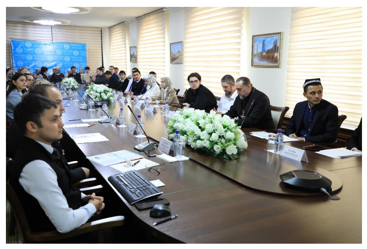
Inclusive Dialogue – A student-led panel discussion features representatives from different faith communities, each contributing their insights on religious harmony. The conference underscores the role of youth in shaping a future built on mutual respect, interfaith cooperation, and peaceful coexistence.