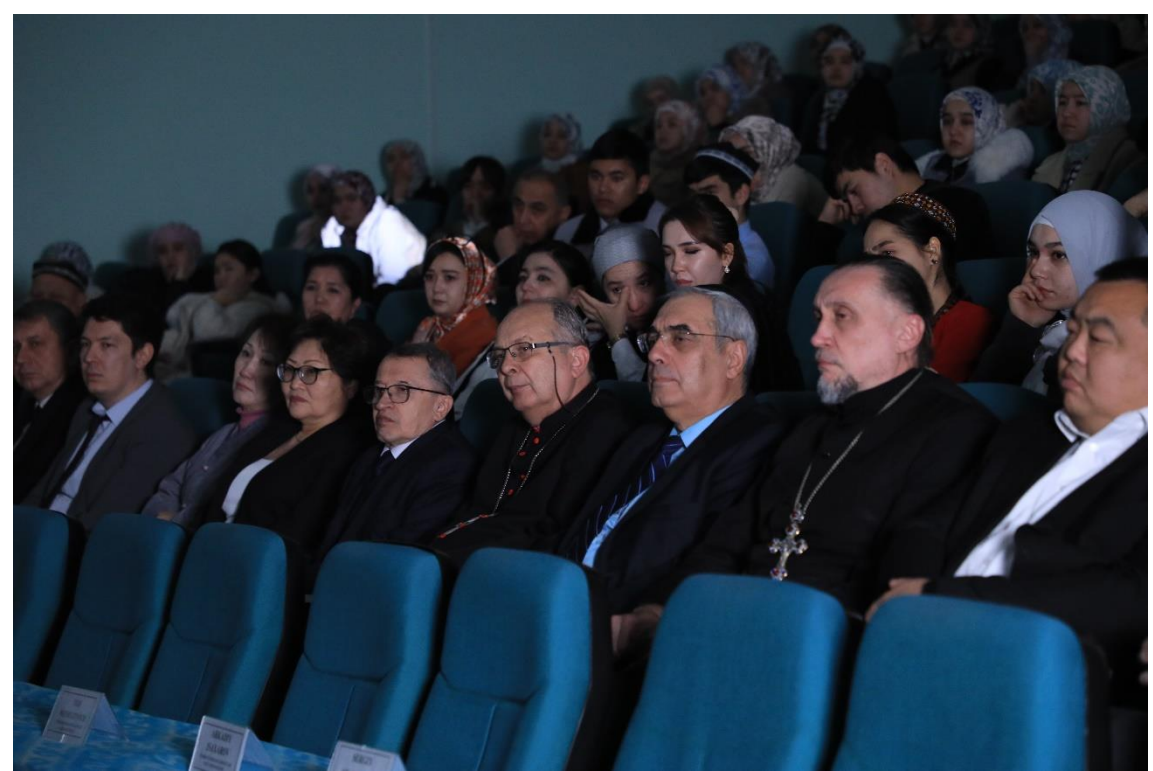
Unforgettable Moments – The auditorium was filled with raw emotion as the story deeply touched the hearts of viewers.