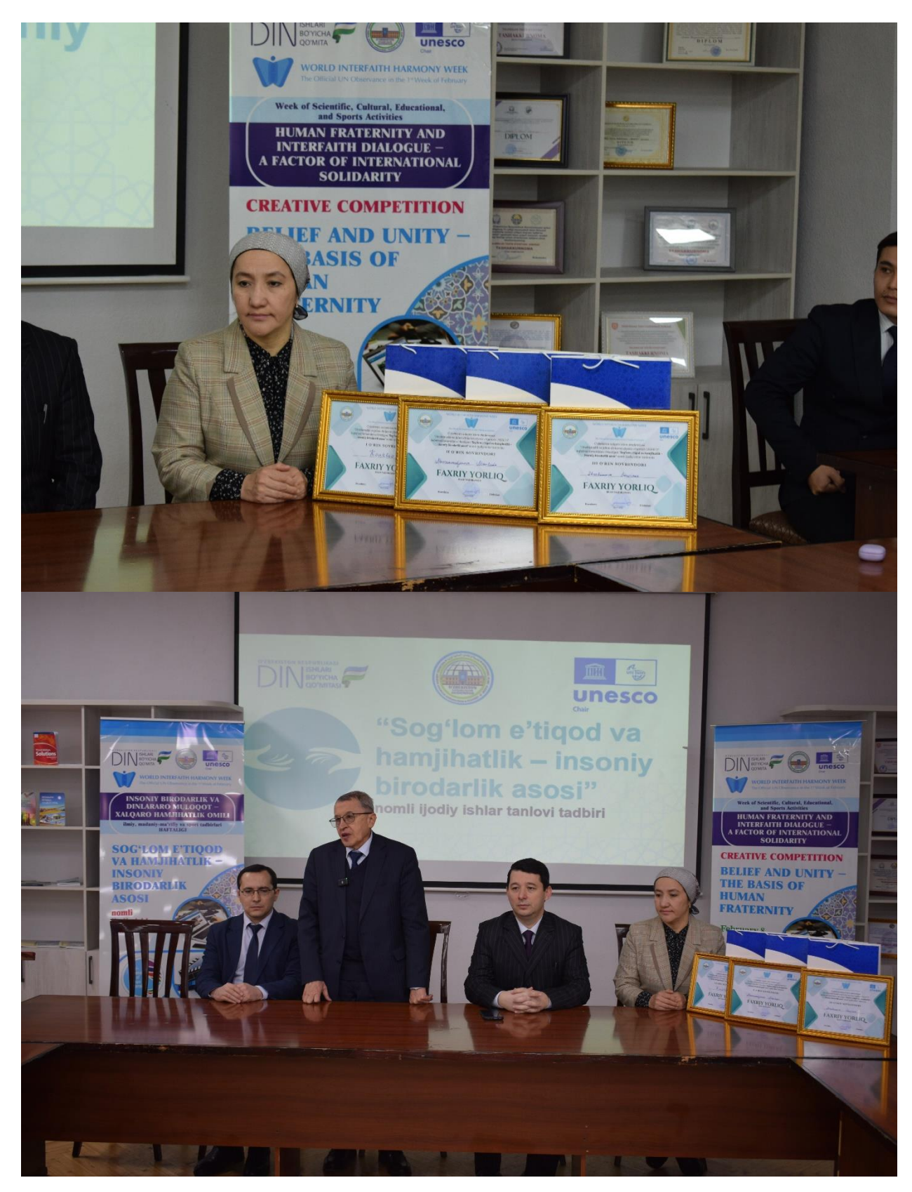
Judging Panel Evaluating Entries – A panel of experts attentively reviews each project, discussing the depth of storytelling, creativity, and the impact of the presented messages.