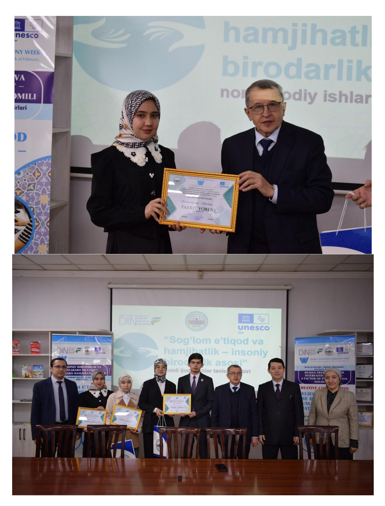
Award Ceremony Honoring Winners – Organizers present certificates and prizes to outstanding participants, recognizing their efforts in promoting dialogue, understanding, and peace through creative expression.