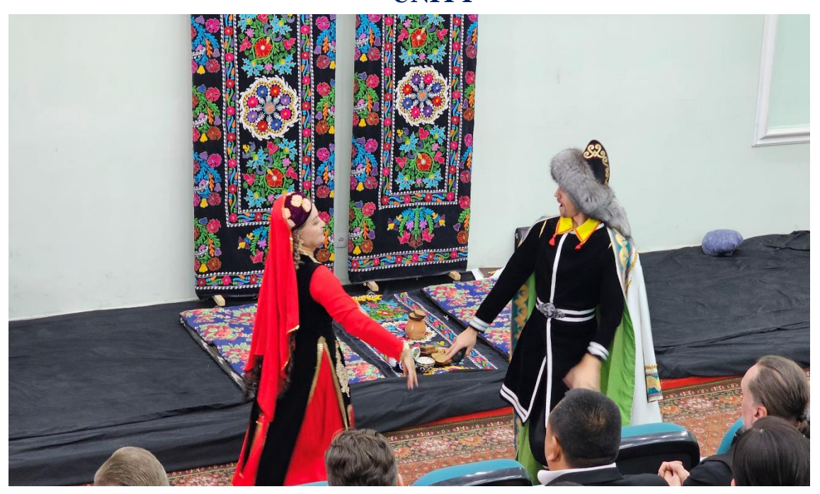
Traditional Performance – Artists showcase Uzbekistan's multicultural heritage through music and dance, symbolizing harmony and shared traditions.