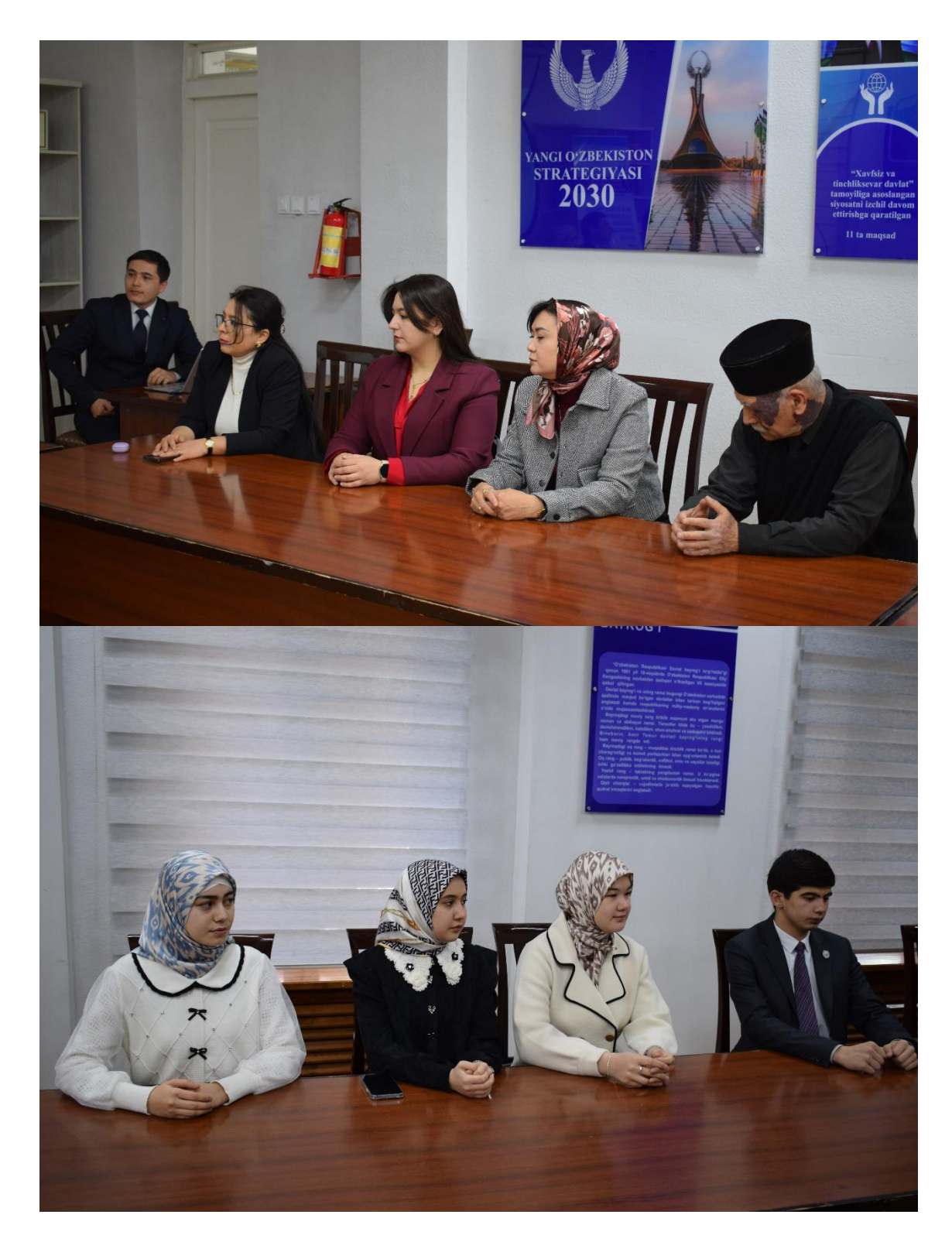
Diverse and Talented Participants – The competition brought together students and young creatives from various universities and cultural backgrounds, each contributing unique perspectives on interfaith unity and human fraternity.