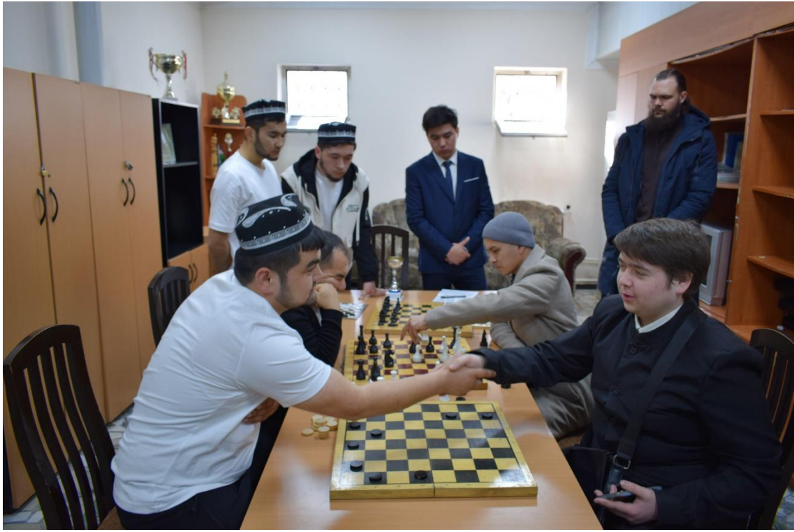
Chess and Strategy – A Game of Patience and Dialogue Participants deeply focused on chess matches, symbolizing strategic thinking, patience, and intellectual engagement as forms of interfaith exchange.