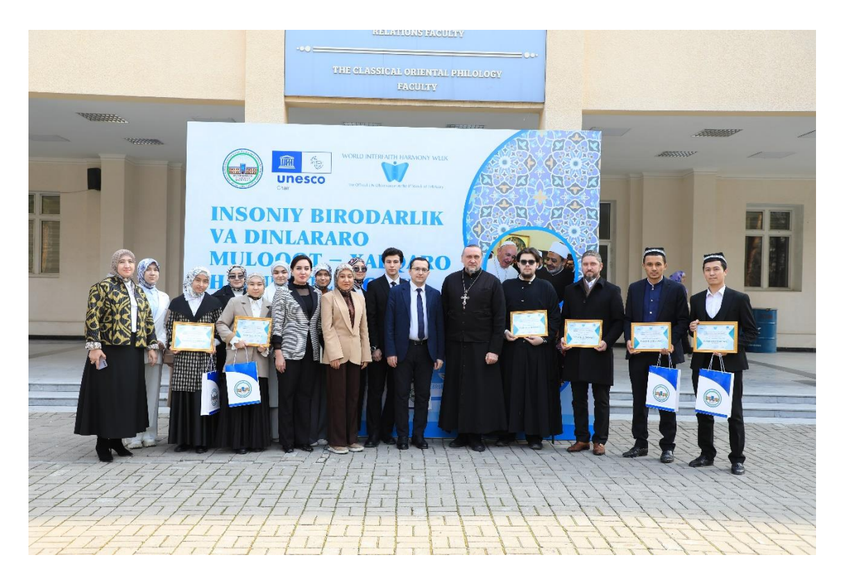
At the conclusion of the conference, the lecturers and speakers gathered for a commemorative photo, marking the successful exchange of knowledge and ideas. Their collective contribution highlighted the importance of academic discussions in fostering interfaith understanding and religious tolerance.