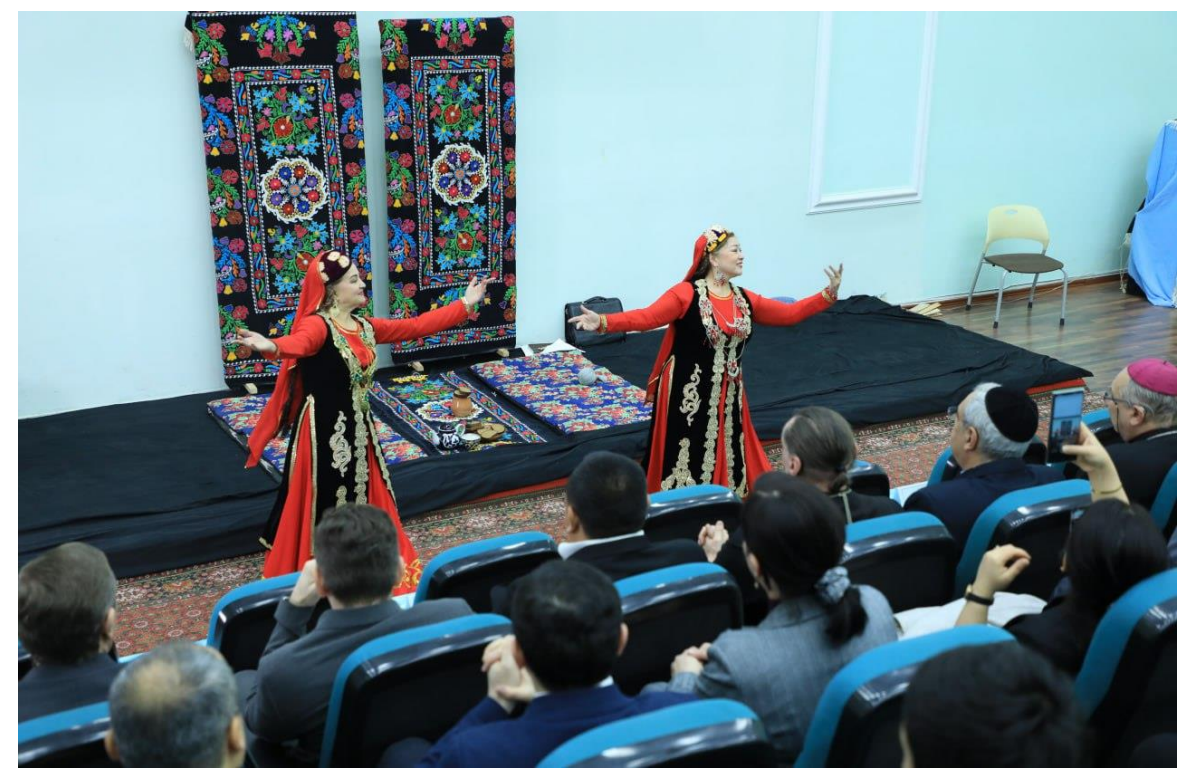
The celebration continued with uplifting performances by members of the Uyghur National Cultural Center, showcasing their rich traditions through music and dance, symbolizing unity in diversity.