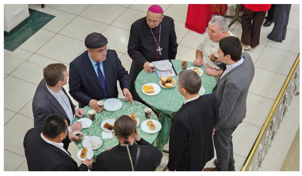
Shared Traditions – Participants exchange cultural and religious perspectives, strengthening bonds of friendship and unity