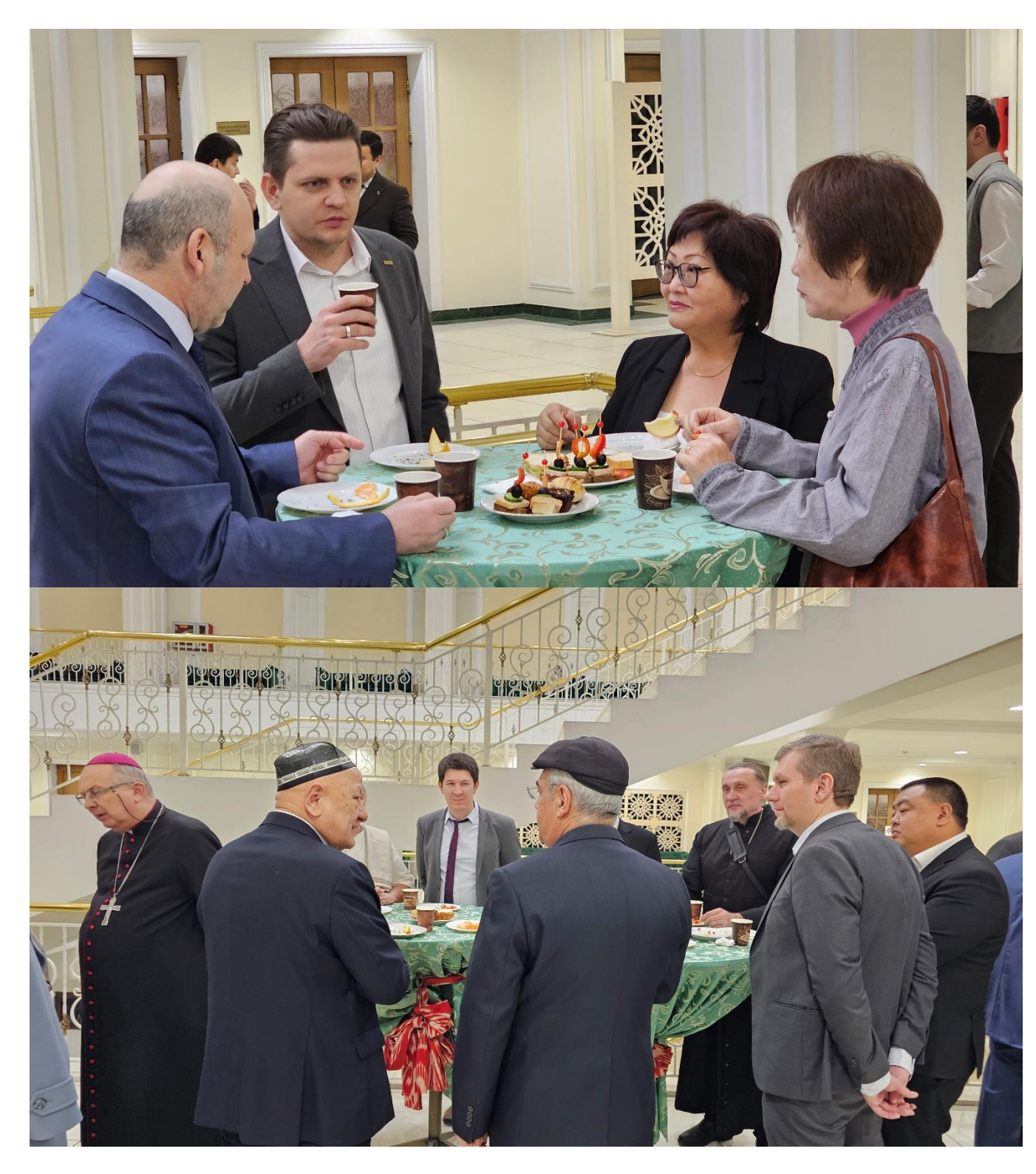
Harmony in Conversation – The gathering creates a welcoming space for open discussions, promoting interfaith solidarity.