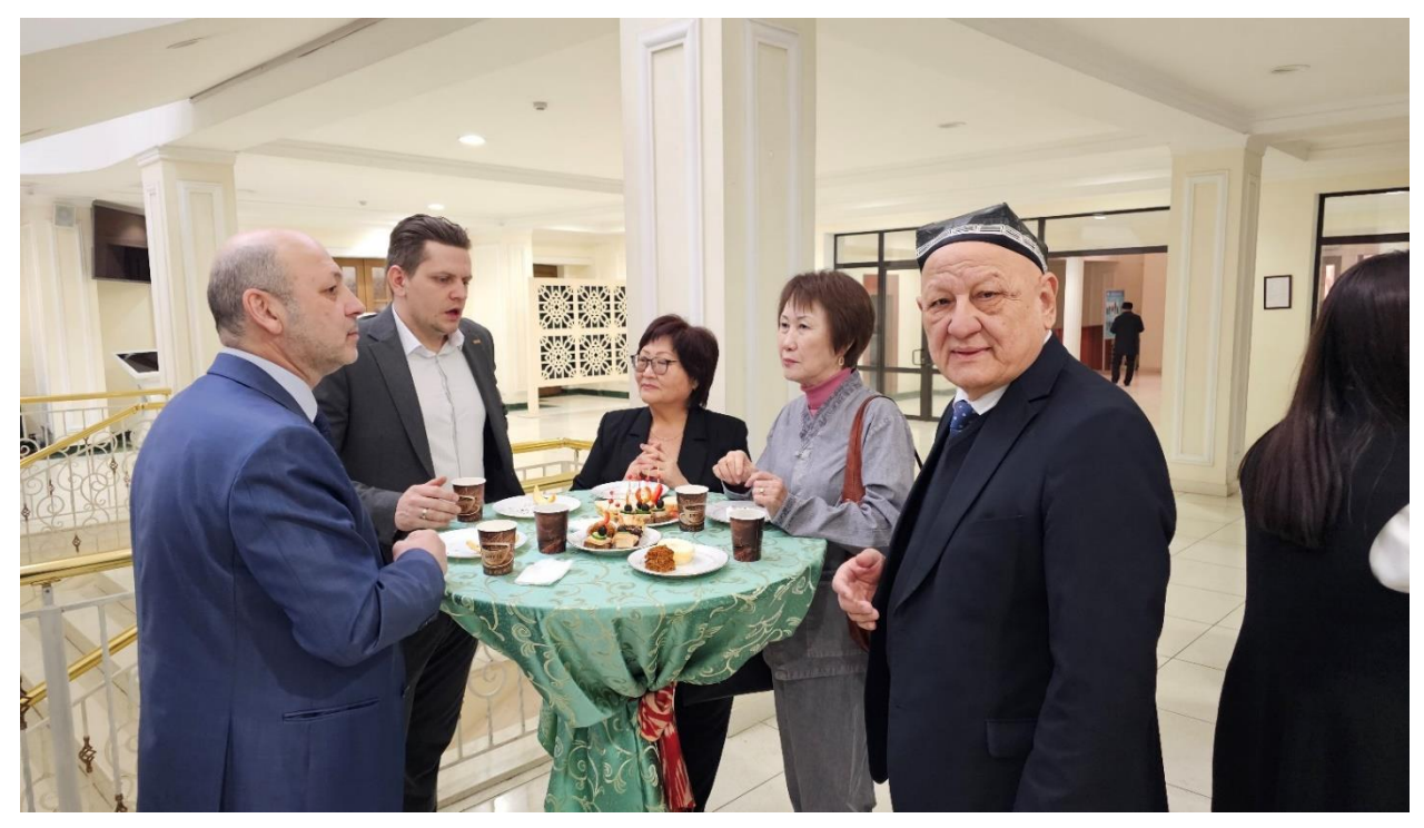
Bridging Beliefs – Religious and community leaders share insights over a common table, highlighting the power of interfaith cooperation