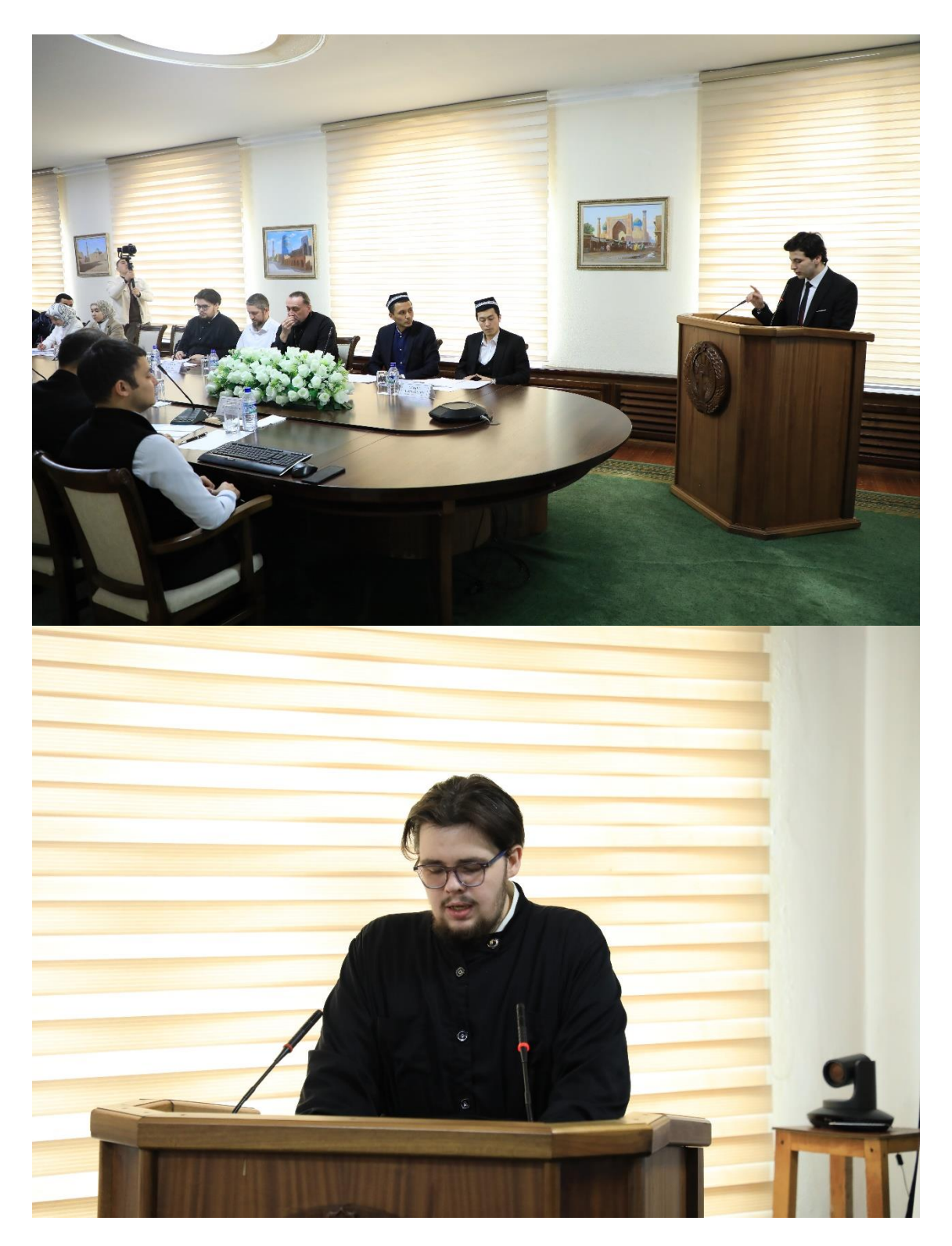
Engaged Discussion – Students from various academic and religious institutions, including the Imam Bukhari Tashkent Islamic Institute and the Tashkent Orthodox Seminary, actively participate in discussions on tolerance and interfaith dialogue. The exchange of perspectives highlights the significance of education in fostering mutual understanding and cooperation.