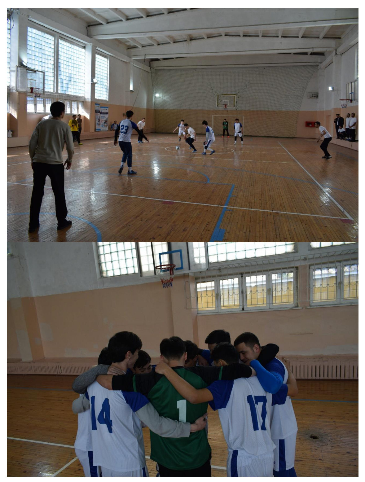
Athletes in Action – Competing with Respect A dynamic snapshot of players engaged in friendly football matches, demonstrating teamwork, mutual respect, and the unifying power of sports.