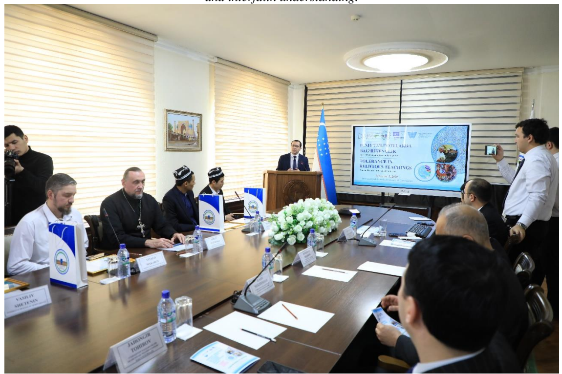
Engaging Dialogue – A vibrant exchange of ideas takes place as students explore the role of tolerance in different religious traditions