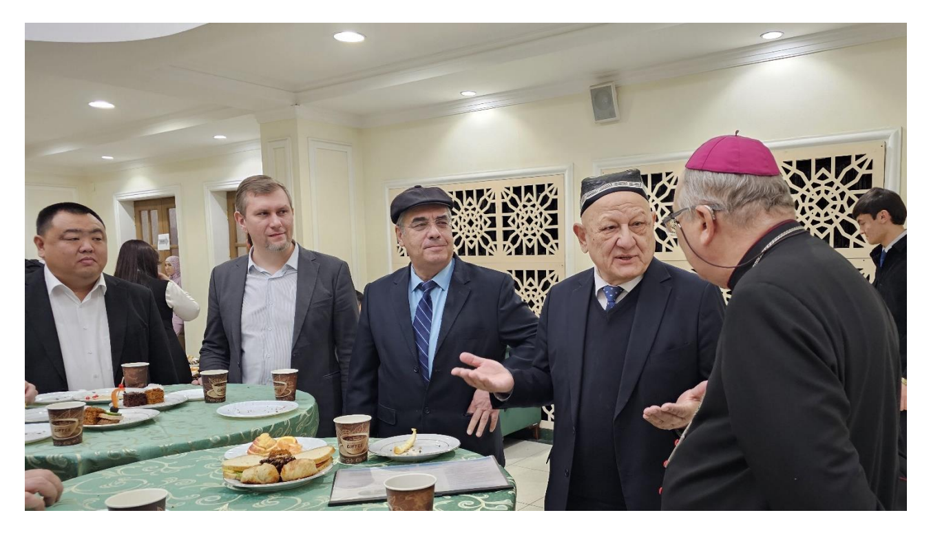
Breaking Barriers – Over a shared meal, attendees connect beyond differences, emphasizing shared values and mutual respect.