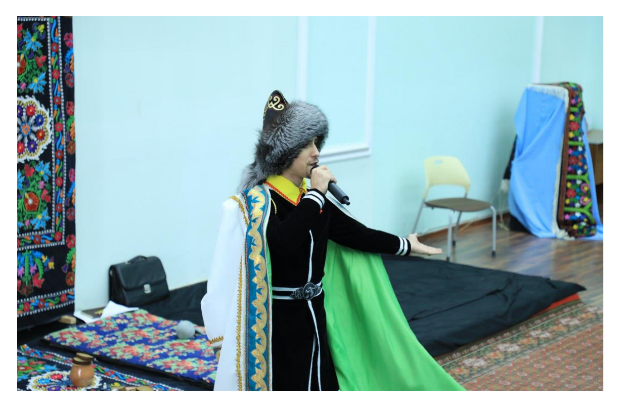
A member of the Bashkir National Cultural Center captivated the audience with a vibrant performance of traditional music and dance, celebrating cultural heritage and unity.