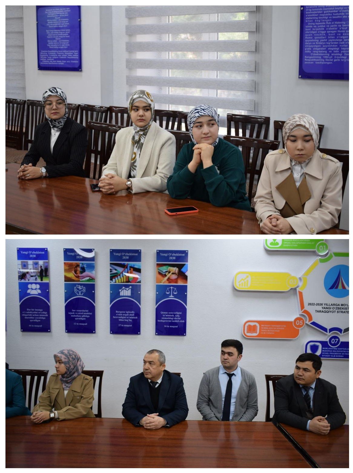
Many participants were passionate about storytelling and social change, using their creative talents to highlight the importance of tolerance, respect, and mutual understanding.