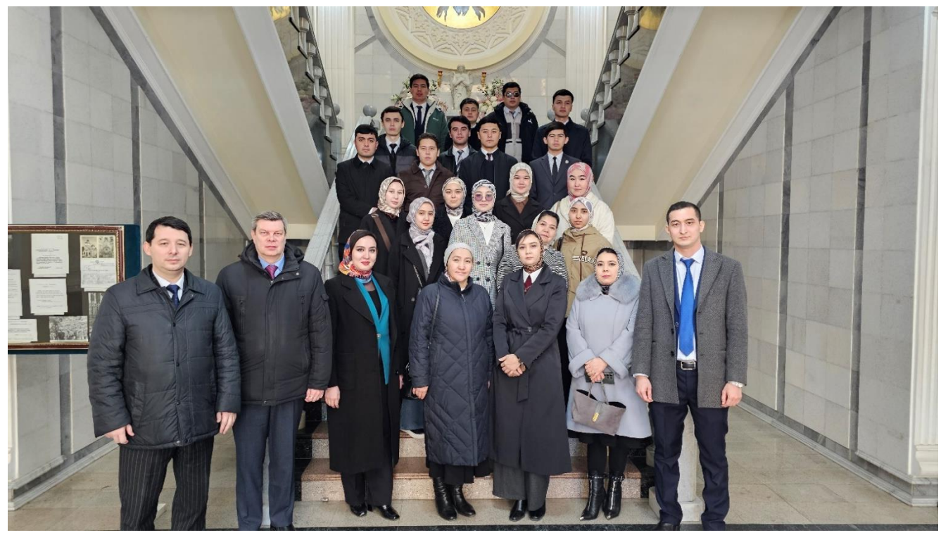
The visit provides an understanding of the Diocese's role in preserving Orthodox traditions and its contribution to Uzbekistan's religious landscape.