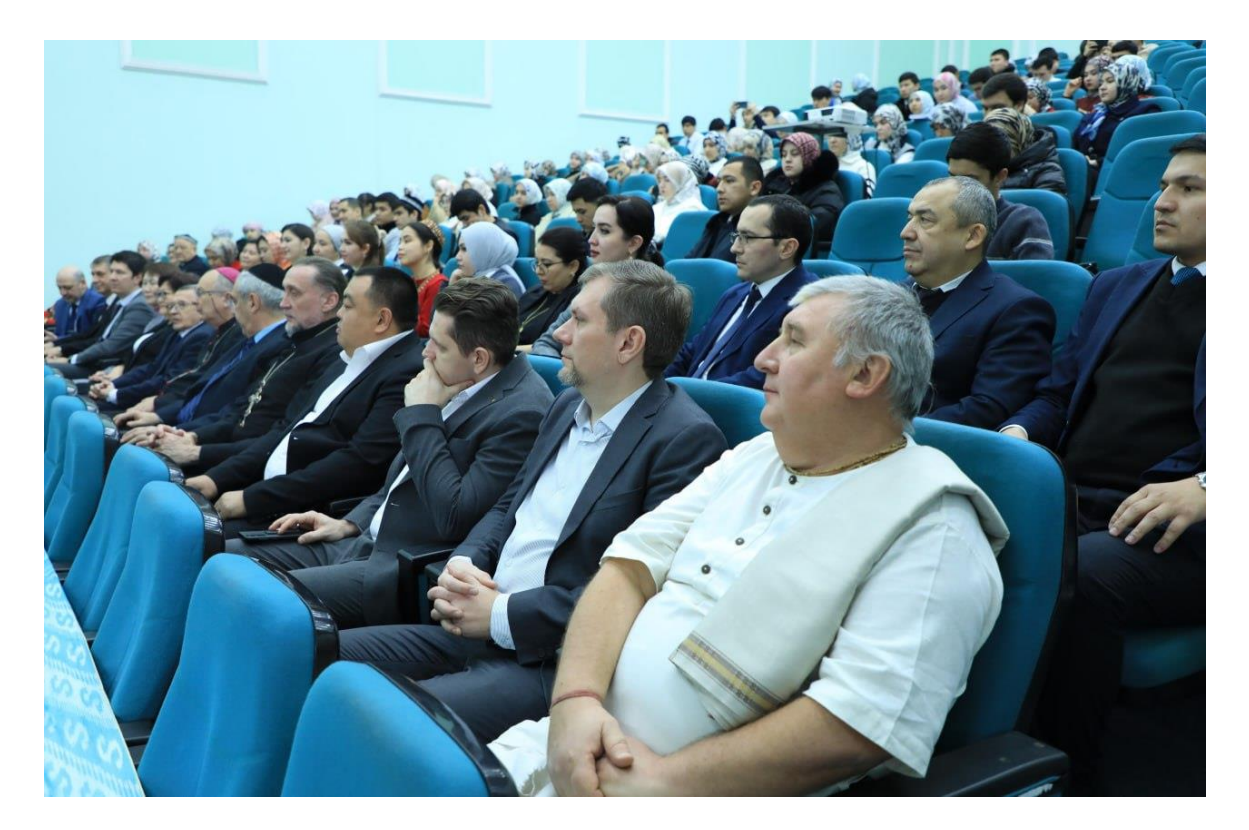
The participants enthusiastically engaged, embracing the spirit of cultural diversity and interfaith harmony.