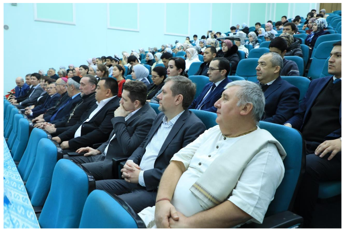
Captivated Viewers – The auditorium is filled with students, faculty, and guests deeply moved by the performance.