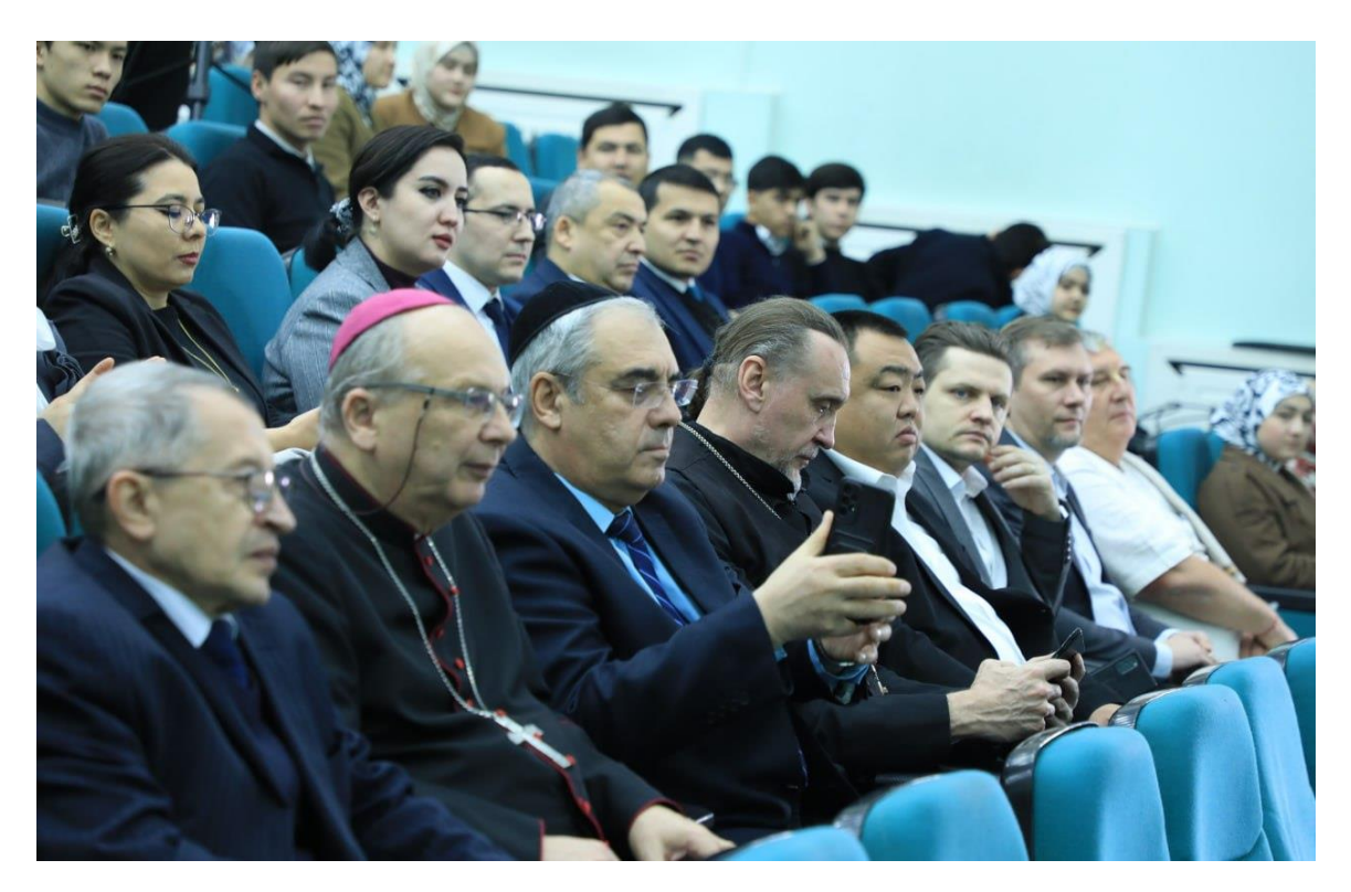
The audience, representing diverse cultural and religious backgrounds, engaged enthusiastically, reflecting a shared commitment to interfaith harmony and cultural appreciation.