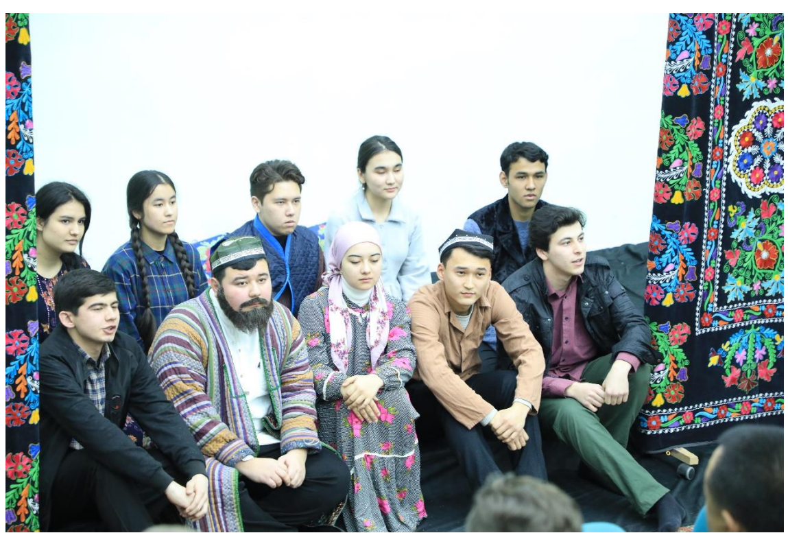
A Scene of Reflection – Every expression and gesture conveys the depth of emotion behind "You Are Not Orphaned."