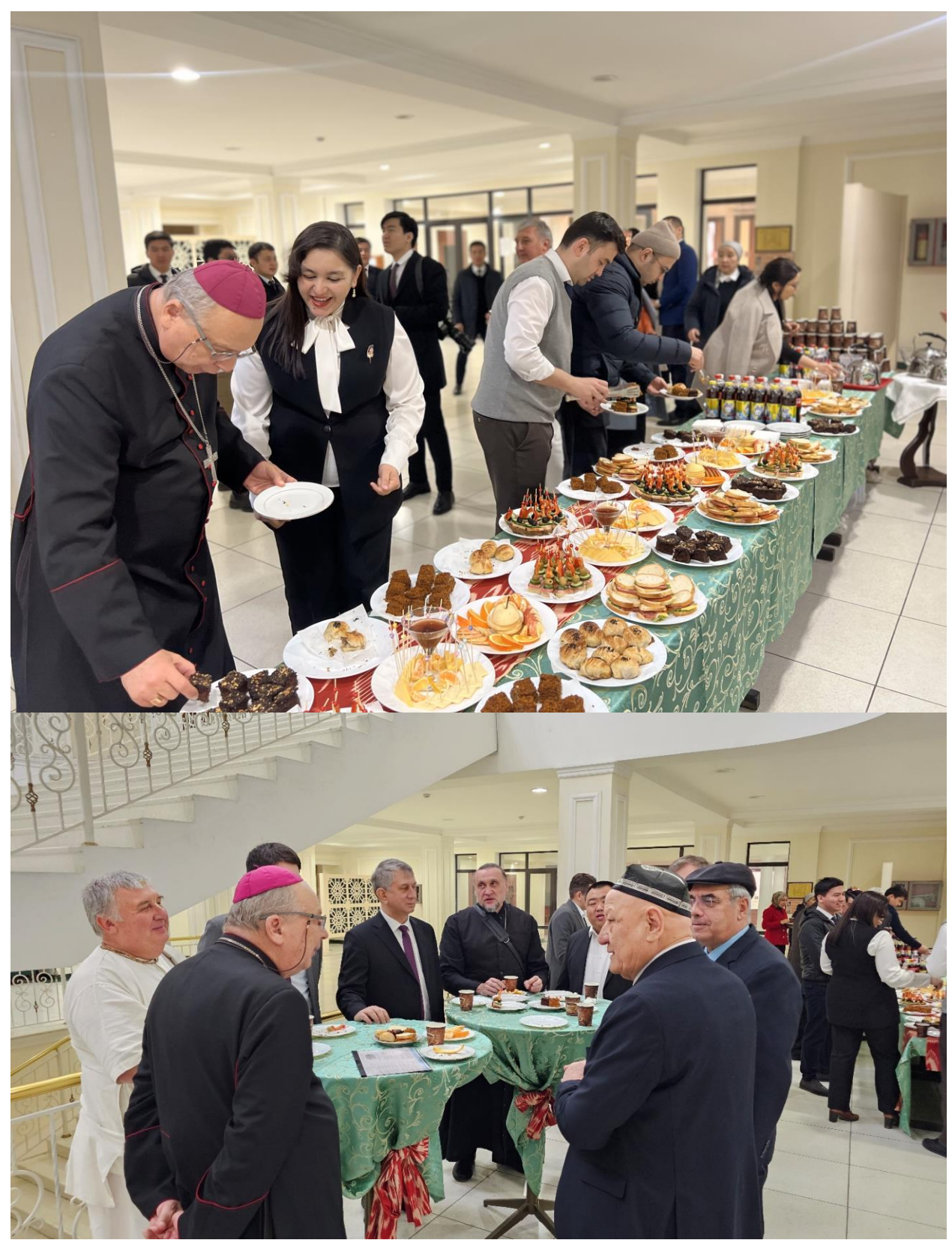
A Table of Unity – Representatives from diverse faith traditions engage in meaningful dialogue, fostering mutual respect and understanding.