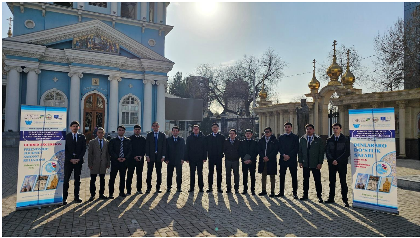
A group photo in front of the church, symbolizing mutual respect among different faith traditions.