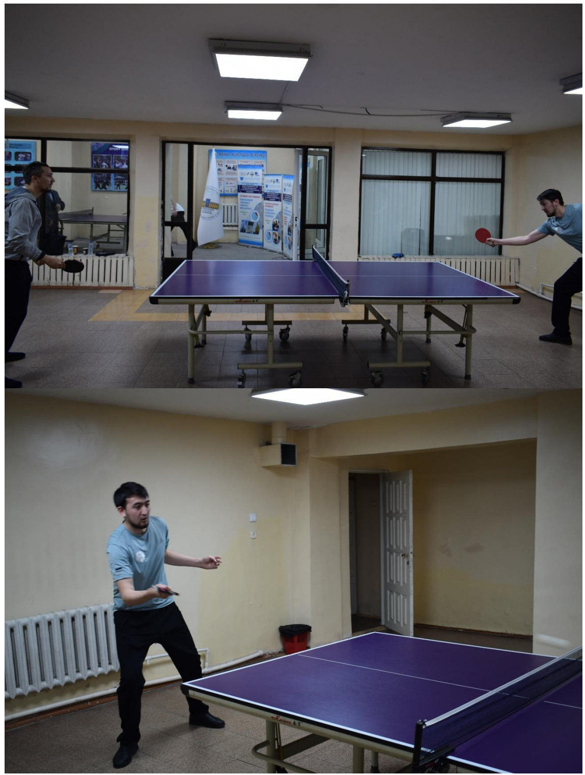
Fast-Paced Action – A Game of Precision. A dynamic moment captured as the ball speeds across the table, with participants reacting swiftly, displaying agility, precision, and sportsmanship.