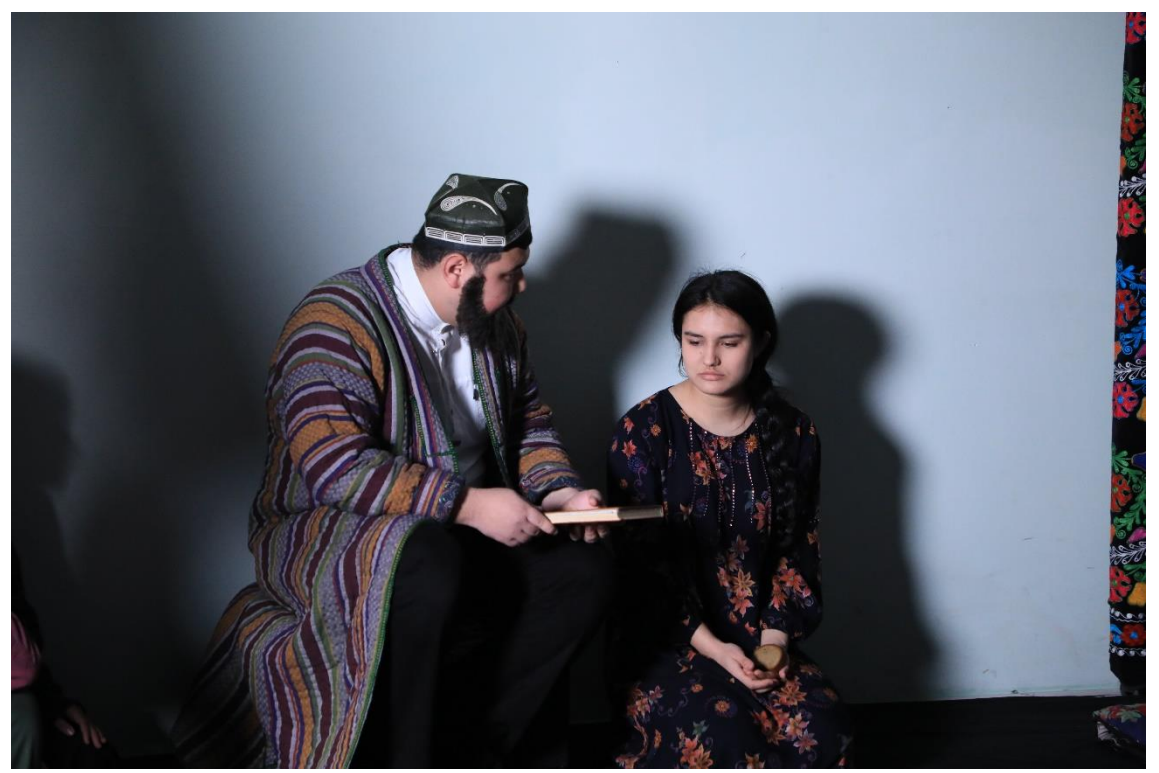
The stage becomes a window into history, reminding viewers of the play's timeless social message.