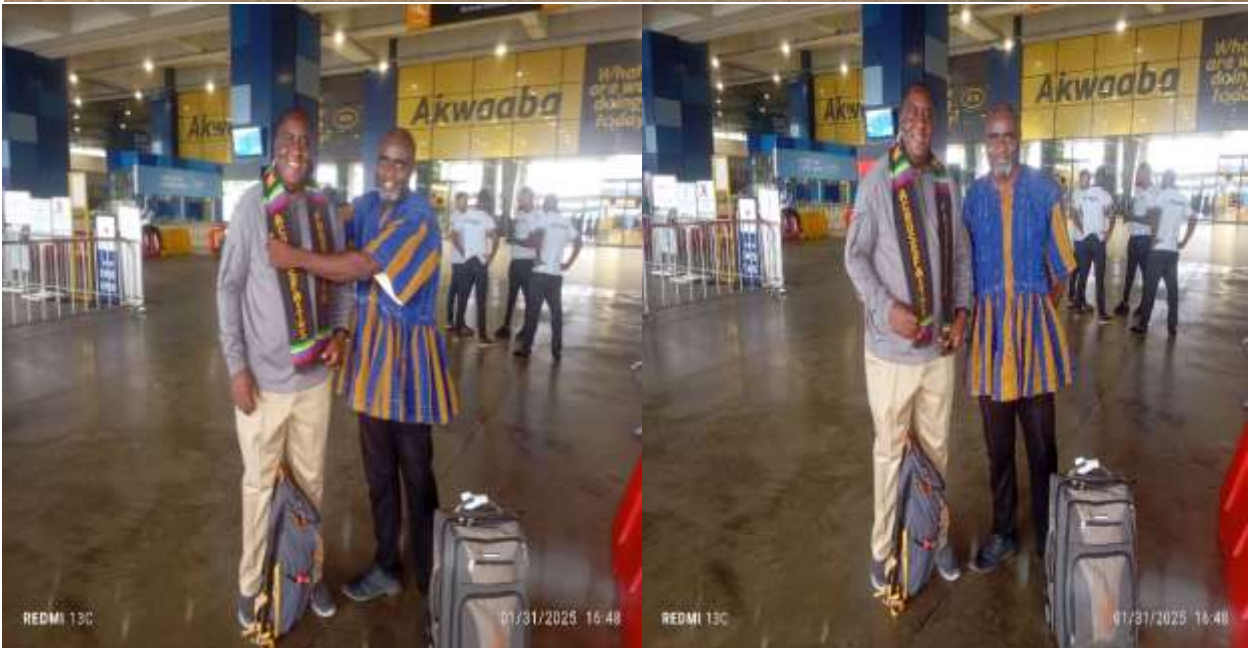
Arrival of the President of the Interfaith Network-Kenya