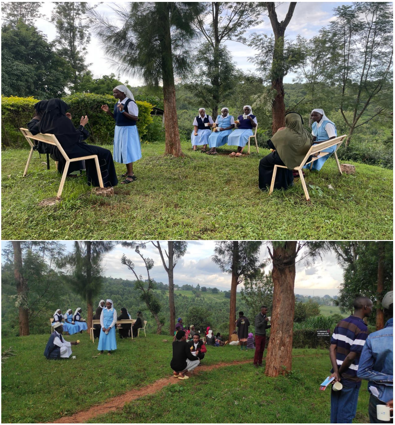
Attendees interact over a cup of tea after the session was over