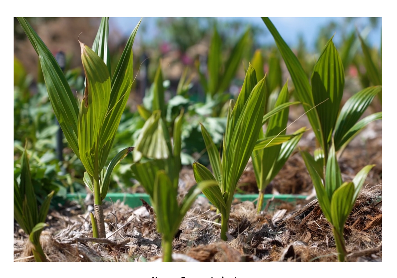
Young Coconut plants