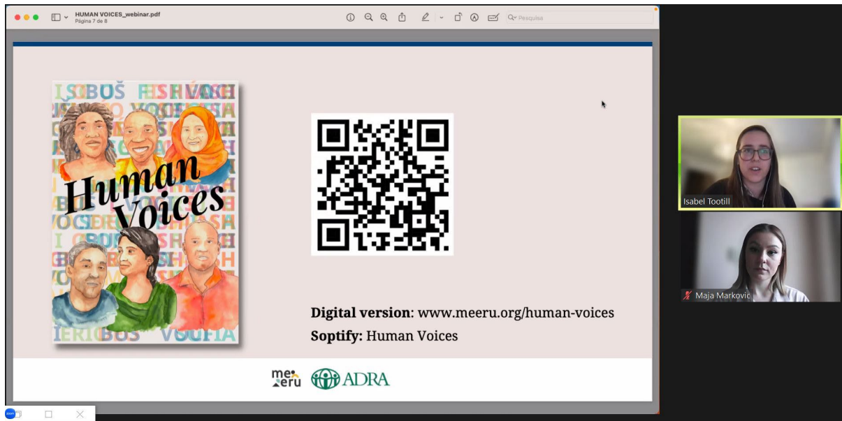
Figure 3 Isabel Tootill and Maja Markovic present their joint initiative "Human Voices"