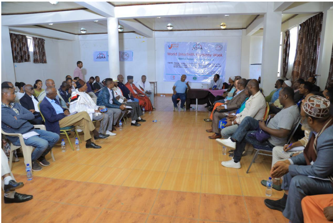
Figure 2-Open and Intensive Discussions among faith groups

The theme of the event was “Strengthening Interfaith Harmony and Collaborator to find Solutions for Challenges related to Freedom of Religion and Belief (FoRB) and Interfaith relationship”. Over 40 faith and traditional belief leaders including Orthodox, Muslim, Protestant, Catholic as well as traditional leaders (Aba Gedas) have been attended and sensitized on #WIHW, FoRB and Social Cohesion for fostering understanding and cooperation between different religious / cultural /ethnic groups.