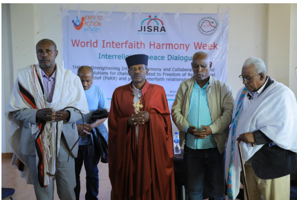
Figure 1-Opening Prayer by Faith Leaders and traditional leaders

Ethiopia has been facing various challenges including intra-religious intolerance which is leading to increased instances of violent confrontation. There is an increase in inter-religious violence in areas across the country including violence targeting the construction of specific places of worship or during religious celebrations and there is also limited interaction between different faith group’s that fuels mistrust and other many problems. As part of ongoing program through the Joint Initiative for Strategic Religious Aciont (JISRA), On February 3rd, 2023 , a one day “Interreligious Peace and Harmony Dialogue” undertaken for observing #WorldInterfaithHarmonyWeek in West Shewa Zone of Oromia Region, Ethiopia.