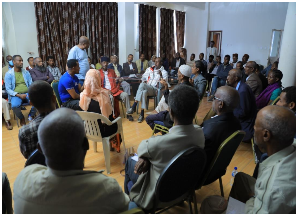
Figure 3- Sensitization on Social Cohesion: Bridging, Bonding, Building

Following Intensive Dialogue, participants vowed to work together in Harmony for resolving community conflicts and in building sustainable peace in their localities. The event was instrumental for assessing interfaith relationships and identifying issues among the community, and device local solutions working together with mutual respect for promoting FoRB and Interfaith Relationship among the divided communities