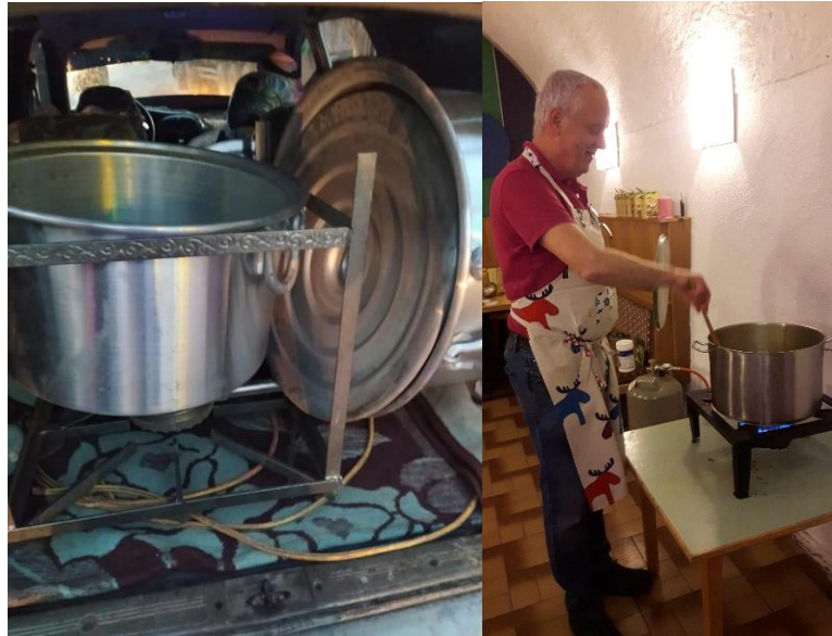
Syria - Soup to help Lienz – Soup to help

For a more sustainable food supply, we will spend money for chickens, for menure. They also help with eggs and new chickens.