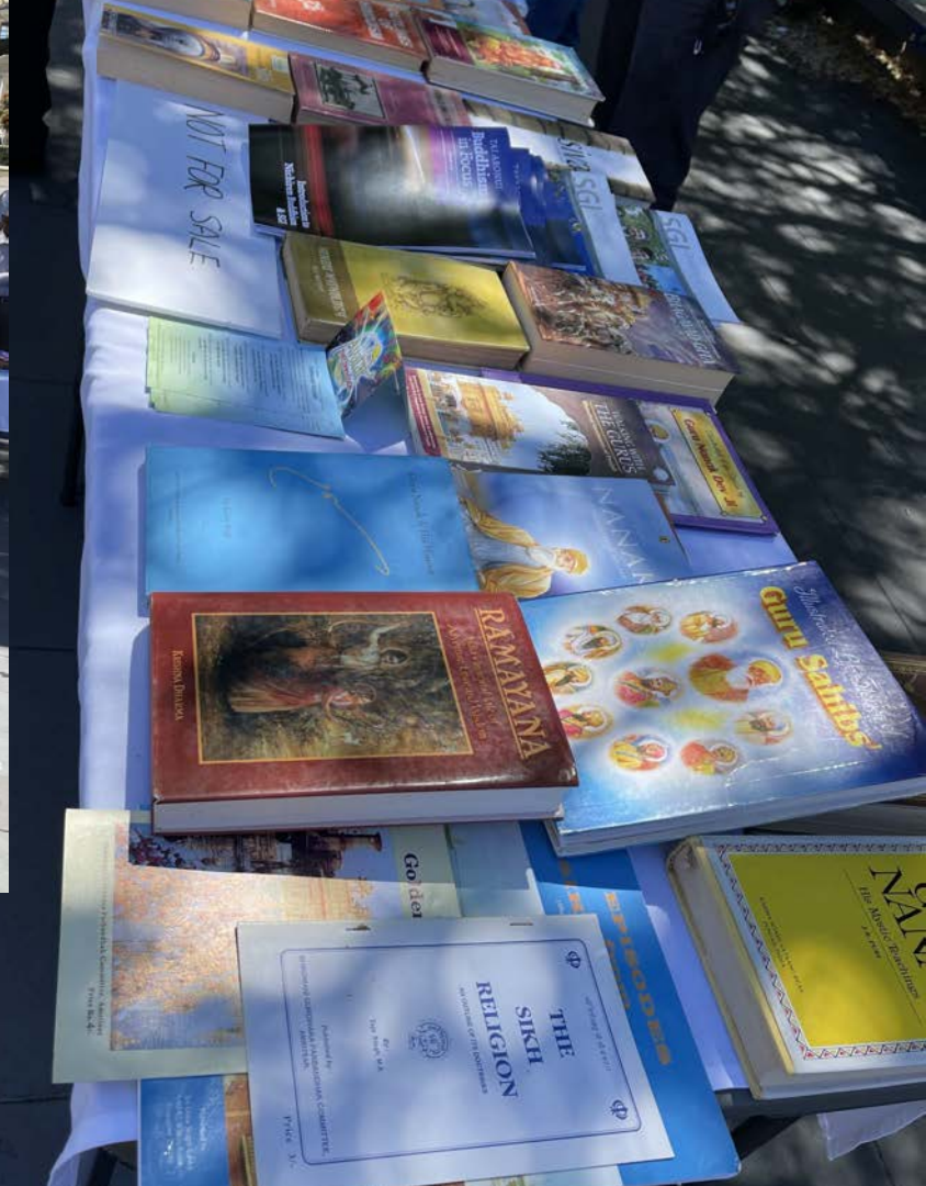
Service & holy scripts on display