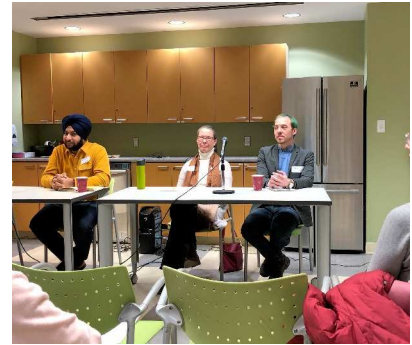
Library Conversations - Bedford Public Library

After hearing from the panelists about the role of faith in their lives and communities, audience members were encouraged to ask questions. These events provided an opportunity for meaningful Interfaith dialogue and relationship building.