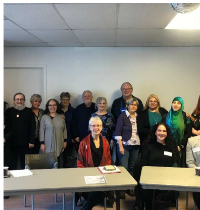
Library Conversations - Keshen Goodman Public Library

“These events provided an opportunity for meaningful Interfaith dialogue and relationship building.