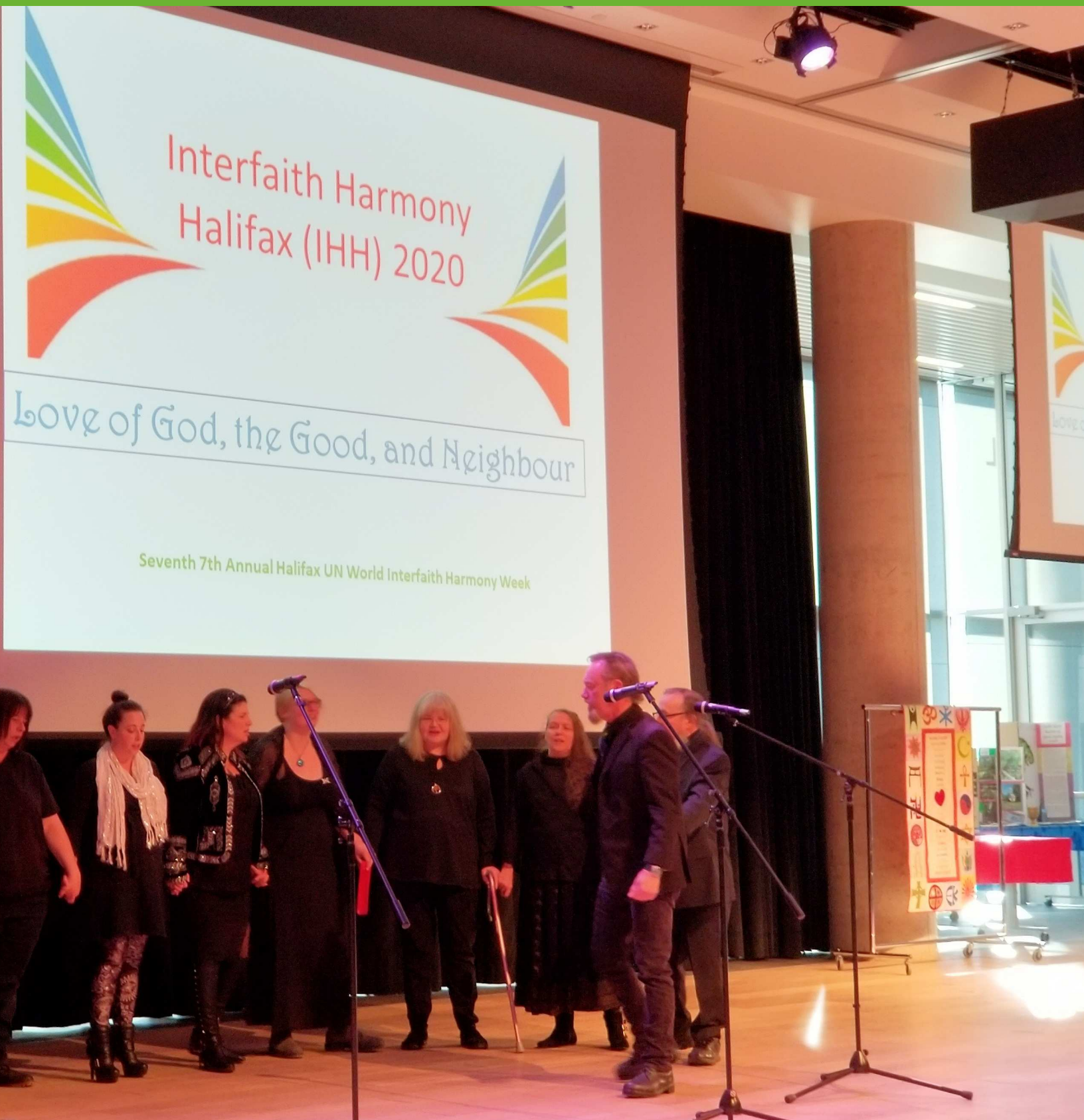
THE PAGAN CHOIR shares music with the assembled audience at Paul O'Regan Hall at the Halifax Central Library