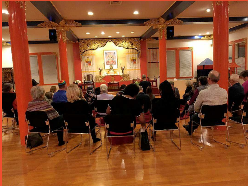
Shambhala Sacred Space