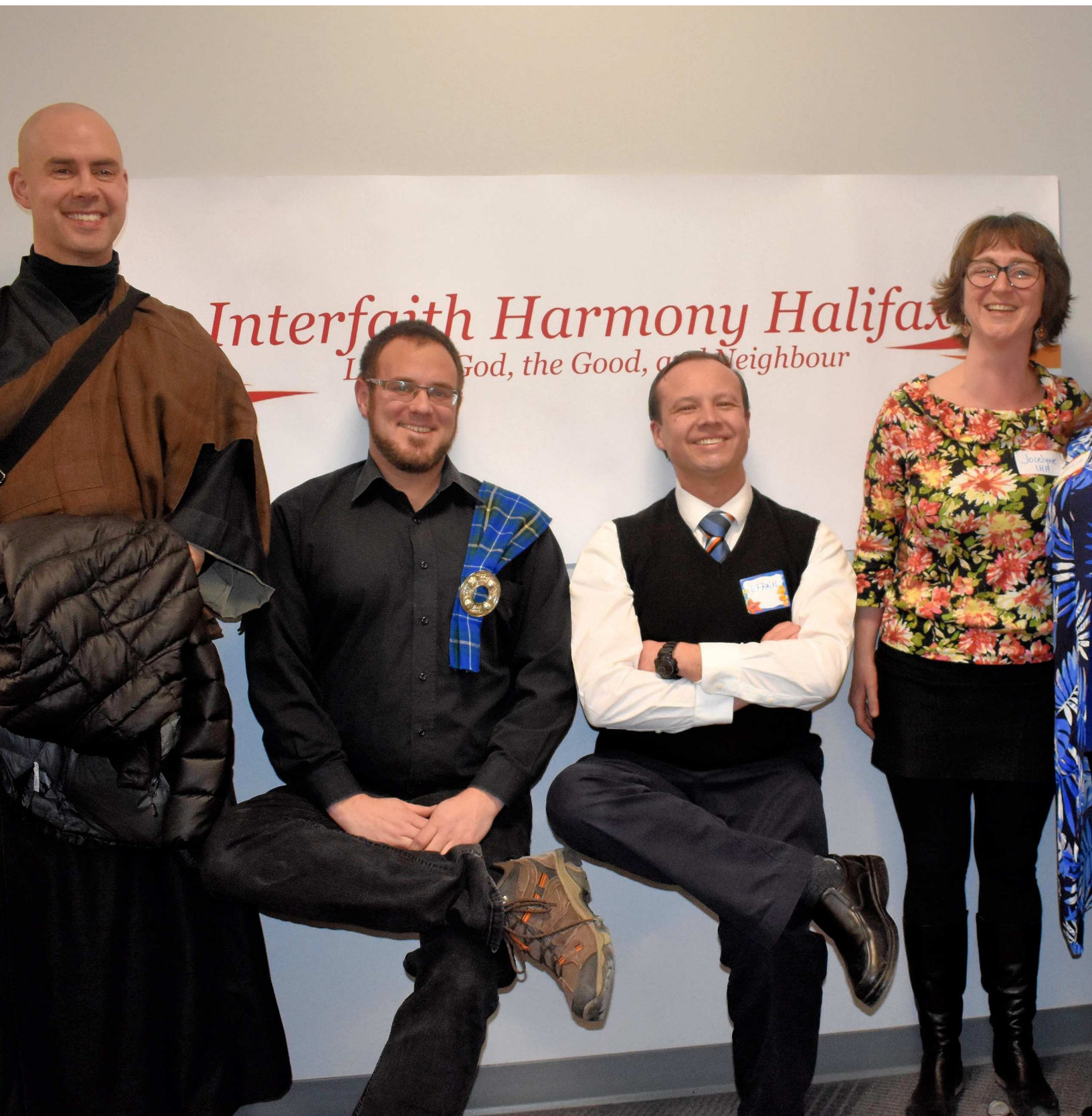
Volunteers hard at work on behalf of Interfaith Harmony Halifax....Thank you!