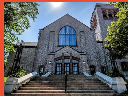
Saint Andrew's United Church

An opportunity to visit sacred spaces in Halifax to observe, meet, and engage with diverse faith communities. All are welcome to participate in the sacred events. Enjoy hospitality, friendship, and refreshments.