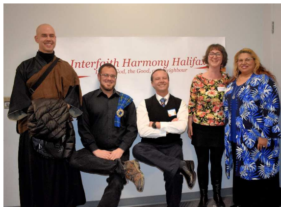
Library Conversations - Woodlawn Public Library

The panels were facilitated by a member of the Interfaith Harmony Halifax organizing committee. Panel participants were asked to share their thoughts on questions related to the role of faith in their lives and communities.