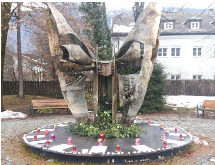
View during the day

We started the activity on December 21th, at the winter solstice. On holy days we lit candles on the evening, prayed together and sent our good thoughts with holy smoke to heaven and with the water of a nearby river to other countries.