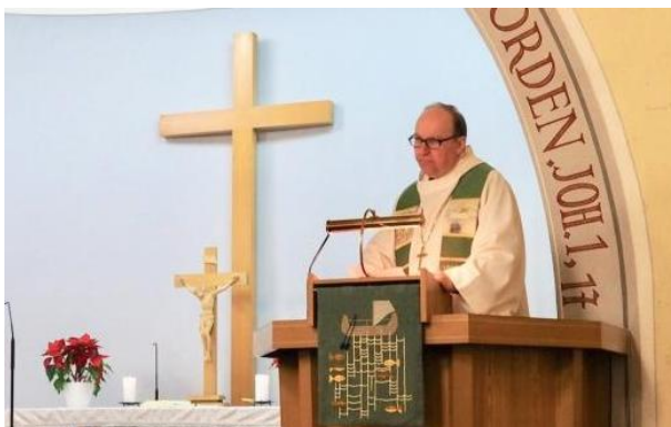
This is a sign for a new time.