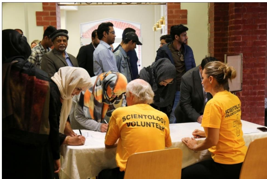
Guests from the South Eastern Ladies Ahmadiyya Muslim Community sign in

On 27 TH February 2019, the Scientology Volunteer Ministers, Victoria Chapter, held their International Interfaith Harmony Day Celebration in the Scientology Community Centre Melbourne. A registration table manned by Volunteer Ministers was set up at reception.