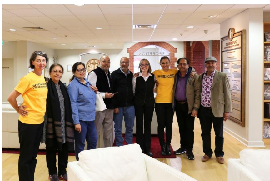
Guests meet Volunteer Ministers and staff

The event started at 10 am with community leaders meeting in the reception area. There they had the opportunity to meet new people and/or catch up with family/friends/colleagues.