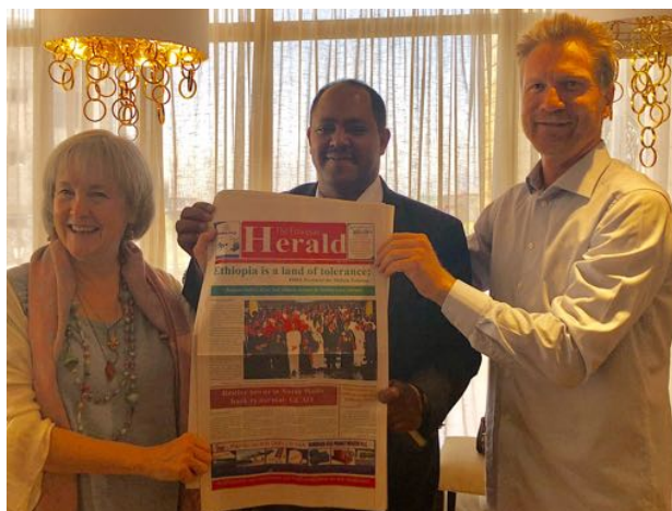
U Day Festival makes Interfaith Harmony front page news in Ethiopia!

World Interfaith Harmony Week Participants Praise Ethiopia for Practicing Religious and Cultural harmony (Ethiopian News Agency)