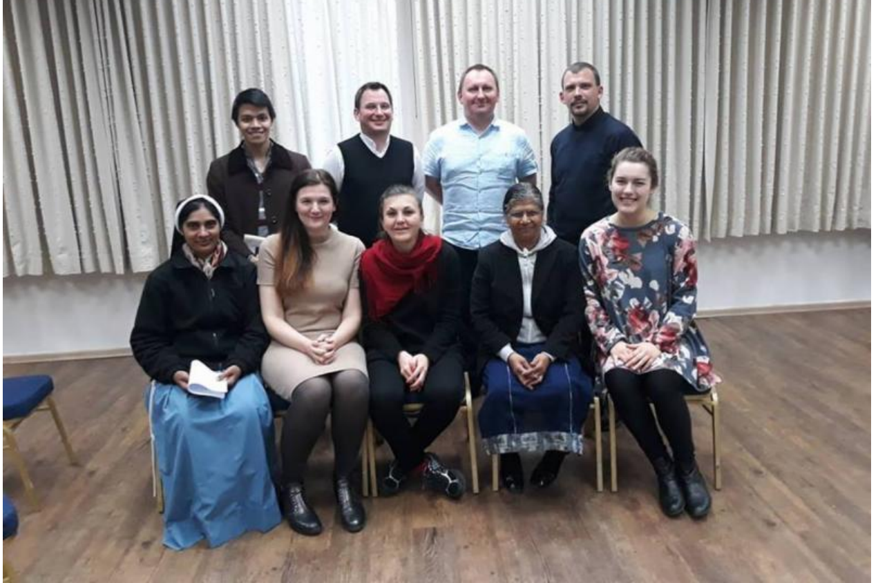
Pictured above is our Cohort X in Israel.