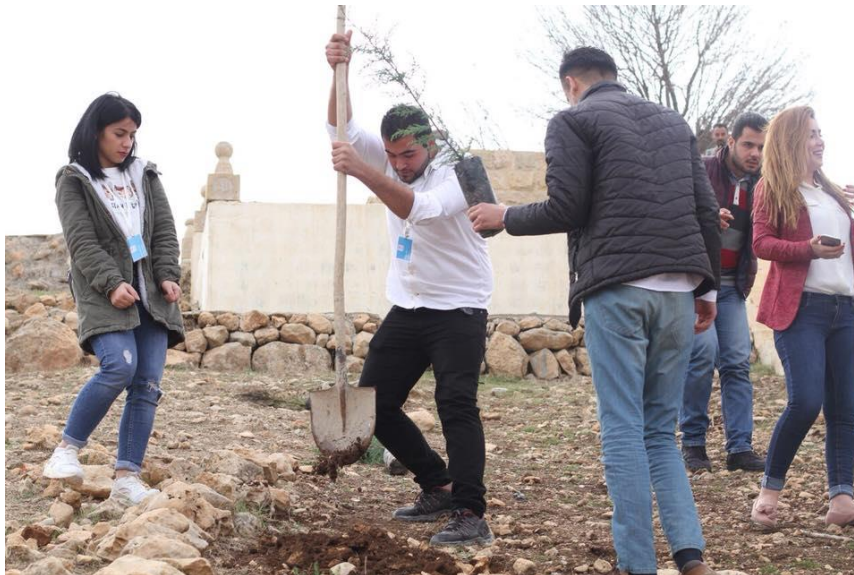
Figures 10 and 11 show planting trees activity in Forqan Mousqe in Duhok city: