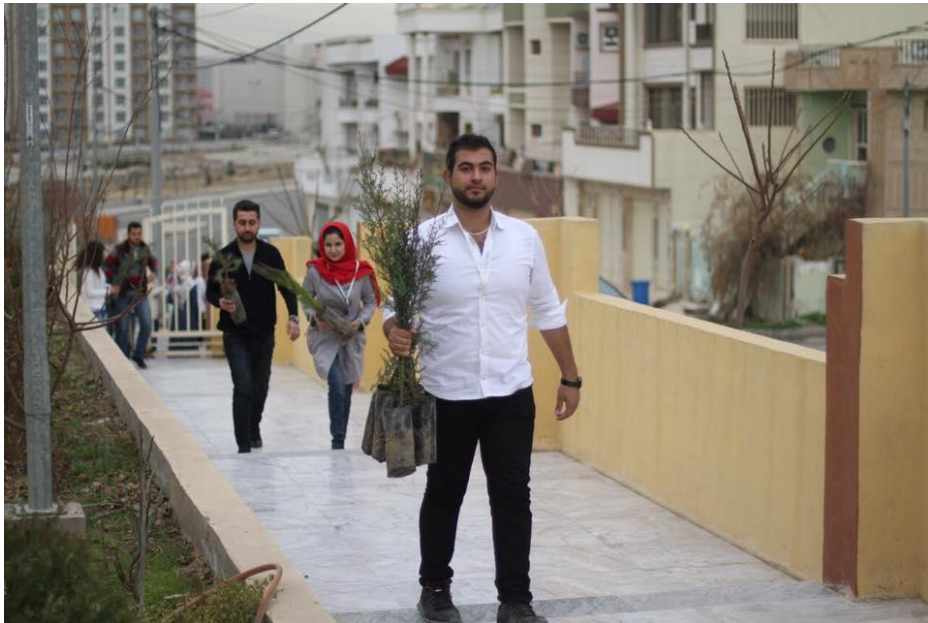
Figures 12 and 13 show planting trees activity in Dara Barani Church in Duhok city: