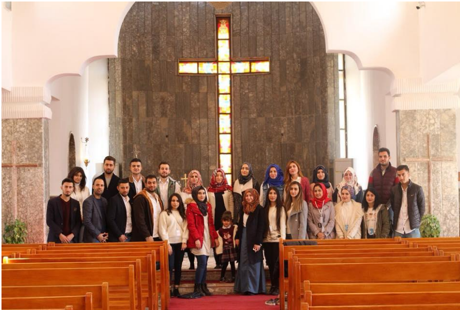
Figure 14 shows the Harmony lunch activity in 3rd February: