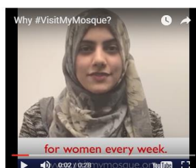
3: ‘What do mosques do?’