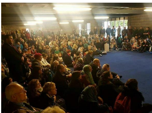
Over 700 visitors went to York Mosque’s open day

The open days held by 159 mosques attracted a vast number of visitors. Whilst most mosques took part on 5 th February, seven mosques, for logistical reasons, took part on other days. The dates and times of each open day were highlighted on the website. In a week that saw an attack on a mosque in Quebec, visitors from all walks of life wanted to extend their solidarity with their Muslim neighbours and took part in #VisitMyMosque day. As a result of a good geographical spread, over 10,000 visitors took part in this initiative. Larger mosques such as Finsbury Park Mosque and East London Mosque attracted hundreds of visitors. Many small mosques also attracted many visitors. Craven Arms Islamic Centre in Shropshire is a mosque that usually attracts around 20 worshippers and they welcomed over 100 people on their #VisitMyMosque day thus highlighting the large reach of this campaign.