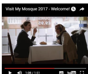
2: Promo for visitors