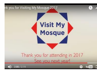
4: ‘Thank you’ video