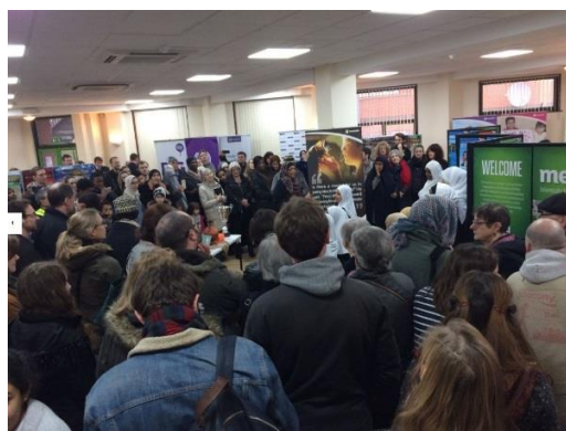
Visitors at Finsbury Park Mosque