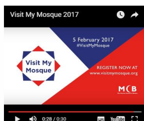
1: Promo for mosques

For 2017, four videos were created by the MCB. The first one was to encourage mosques to sign up- this was shown on TV One and highlighted the benefits of the #VisitMyMosque initiative. The second video was a roleplay that encouraged non-Muslims to visit their local mosque. The third video showcased the impact that mosques are having on their local communities and included examples such as aerobic sessions, food banks and cleaning up streets. The fourth video was a ‘Thank you’ video which contained initial pictures that and feedback that was coming through via social media.