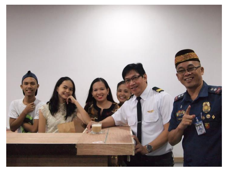
Imam Ebra Moxsir, President of the Imam Council of the Philippines joins the Ka-Tropa team in a light moment.