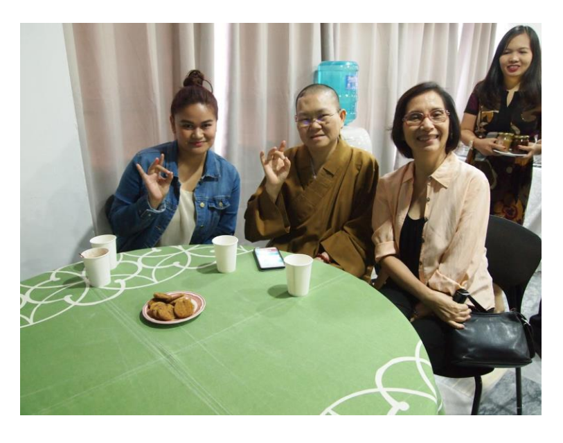
Buddhist friends congratulate CBCP-ECID for coming up with a show that helps erase biases and prejudices against religion.

Catholic Bishops' Conference of the Philippines