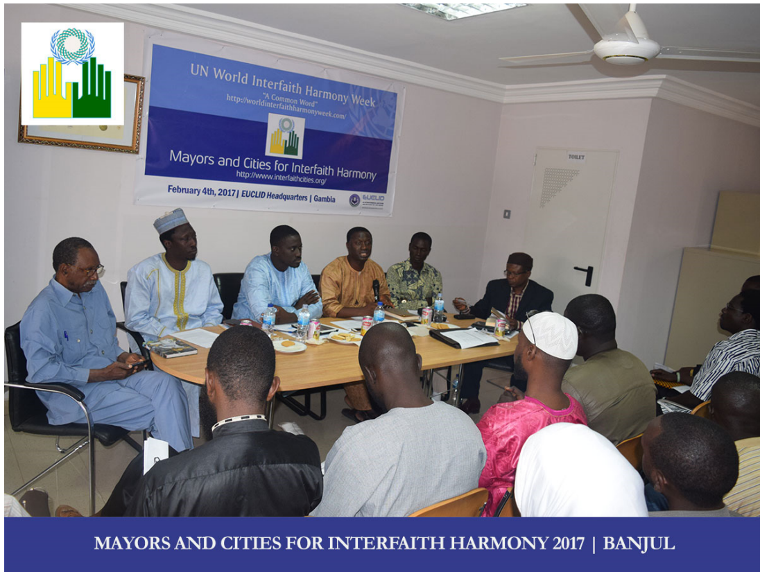
MAYORS AND CITIES FOR INTERFAITH HARMONY 2017 | BANJUL

Photo above: Presentations and discussions at the High Table, with a audience of about 30 attentive listeners.