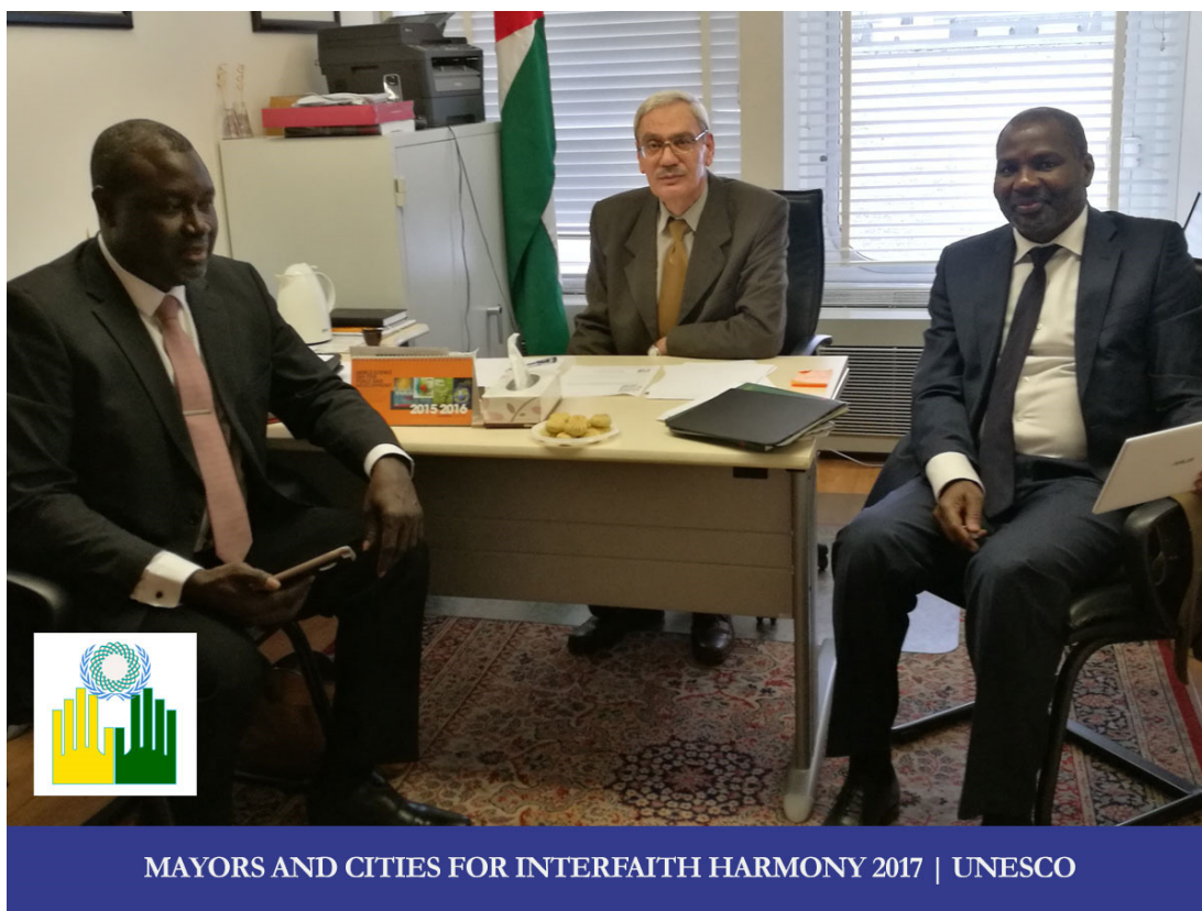
Photo above: the representatives of Central African Republic, Gambia and Jordan also discussed means to create greater awareness and recognition for the UN World Interfaith Harmony Week and “Interfaith Cities (MCIH)” at the level of UNESCO.