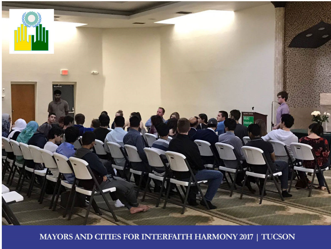
MAYORS AND CITIES FOR INTERFAITH HARMONY 2017 | TUCSON

The Proclamation issued by City of Tucson (Arizona) was officially dated February 1, 2017 and was announced at the Interfaith event hosted by the Tucson Islamic Center.