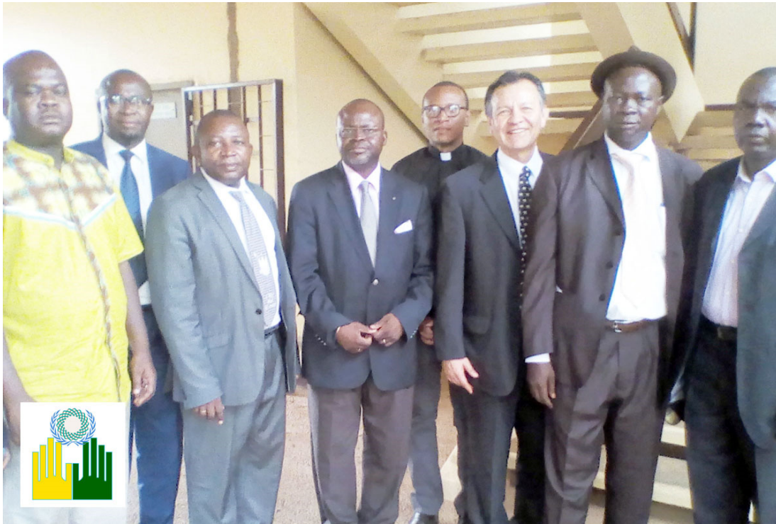
MAYORS AND CITIES FOR INTERFAITH HARMONY 2017 | BANGUI

Photo above: the speakers and organizers.