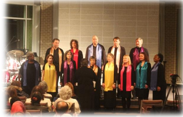
Metropolitan Washington Baha'i Chorale