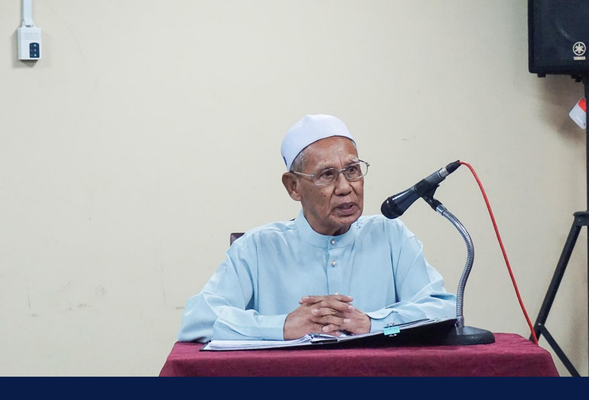
Explaining why Muslims Pray