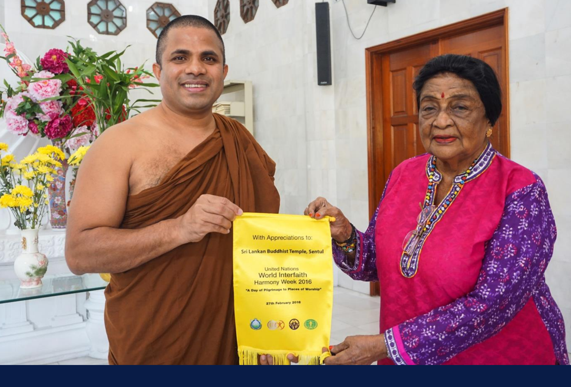
A Token of Appreciation