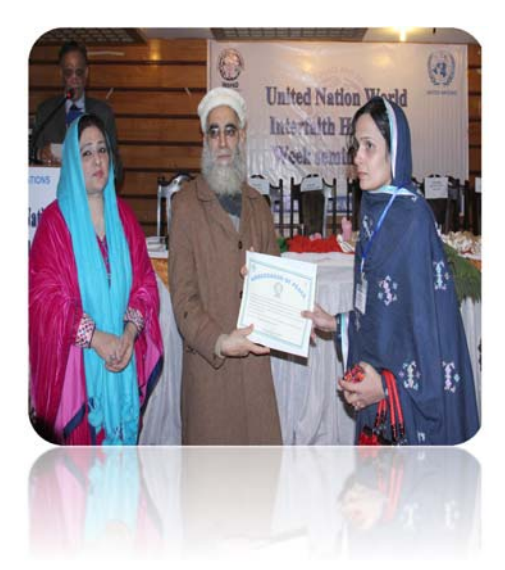
Participant taking the certificate