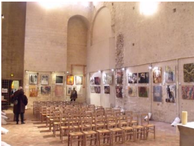
Installation of The Bridge exhibition