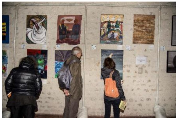
Viewers of The Bridge exhibition