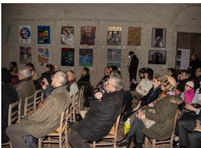
Opening Ceremony with Religious Leaders