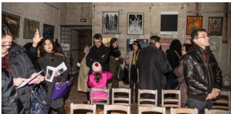
100's of daily viewers of The Bridge Exhibition