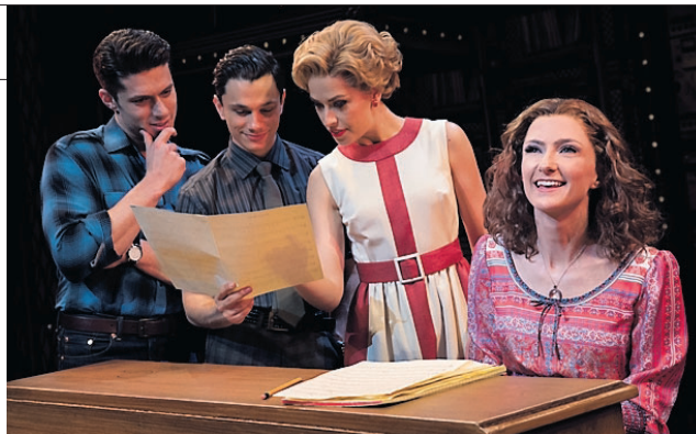
Earth Move and One Fine Day.

TOMORROW, 8pm, Hamer Hall, Arts Centre Melbourne, 100 St Kilda Road, city, $90,