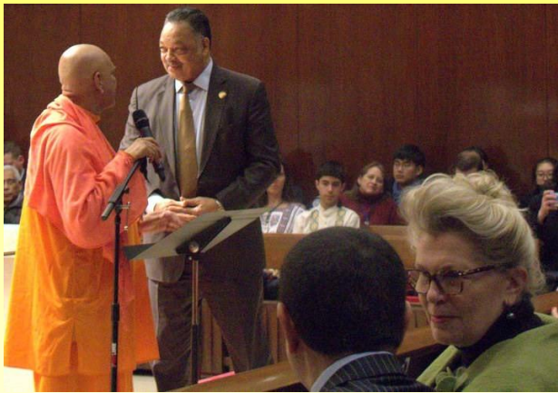
Rev. Jesse L. Jackson Sr