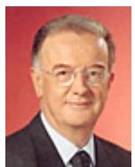
H.E. Jorge Sampaio UN's The Alliance of Civilizations and Former President of Portugal