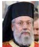
Archbishop Chrysostomos II Archbishop of Cyprus

The World Forum for Proximity of Islamic Schools of Thought