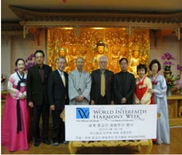
Understanding Islam, South Korea – 4 February 2012 at the Chung-ho Buddhist Cultural