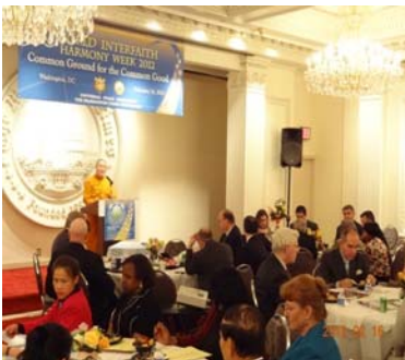
The World Interfaith Harmony Week 2012 at Washington Times Foundation