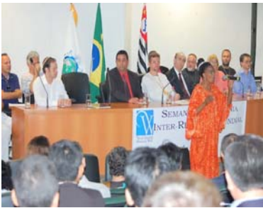
Semana da Harmonia Inter-Religiosa Mundial