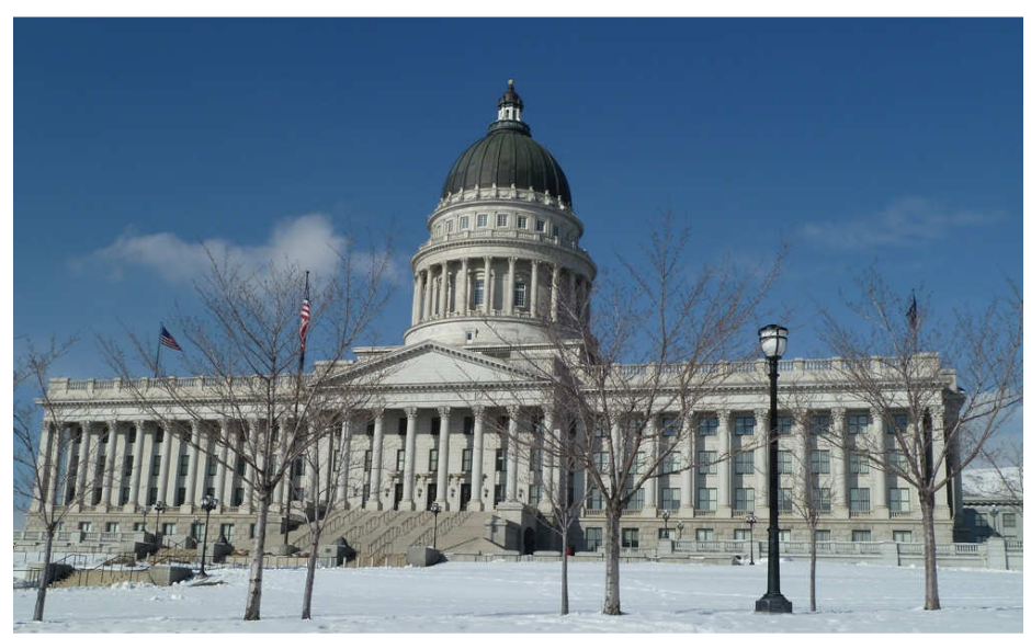
Utah State Capitol

First Nation Indian Blessing in Recognition of Interfaith Month 2016 Utah State Capitol Rotunda Friday, February 5, 2016 - 3:00 p.m.