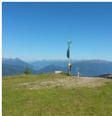
Place on the top of the mountain (picture from sommertime)