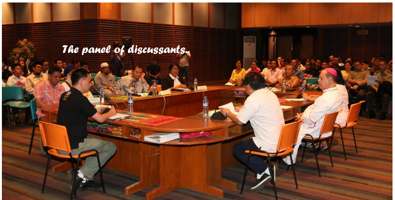
The panel of discussants..