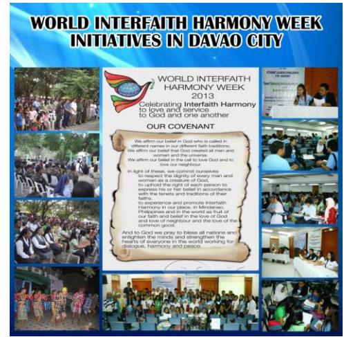
Silsilah Forum Davao displayed photo gallery of WIHW initiatives in Davao City in cooperation with the Harmony Links from 2013 until 2016.