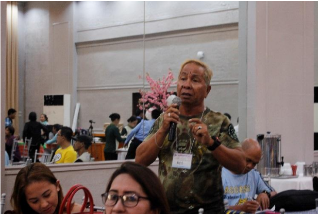
The presenter facilitated the Open Forum.