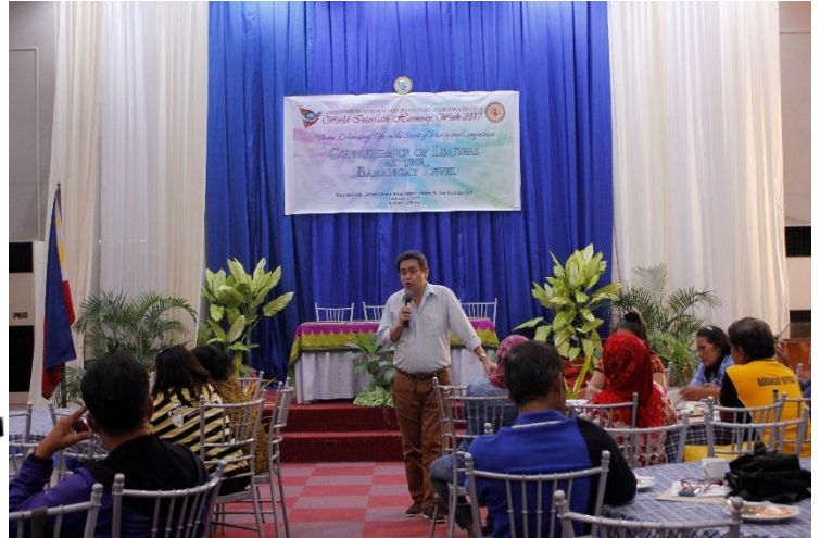
Open forum with the Barangay Leaders