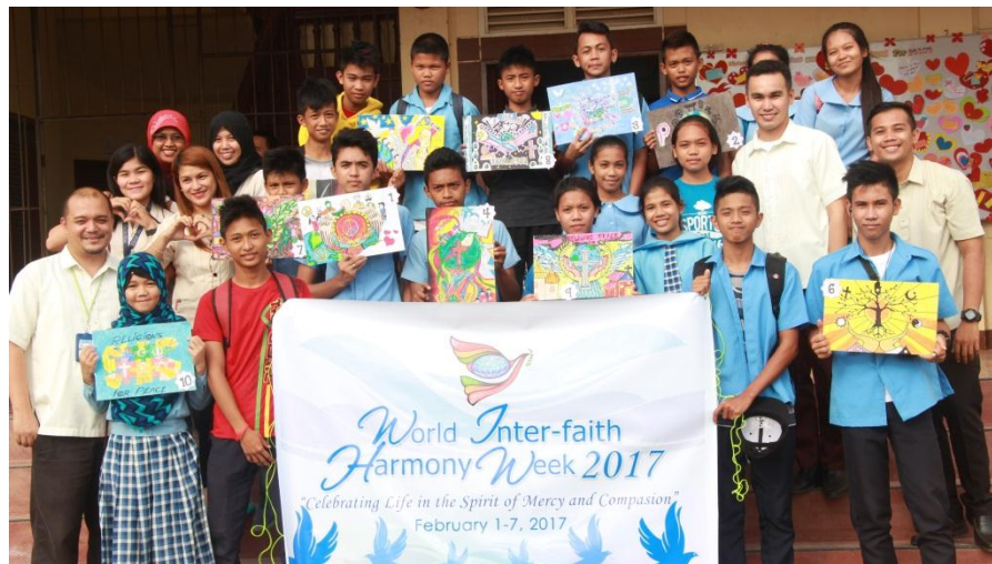
The Faculty and some students participating in the event shared a group photo at the end of the activity