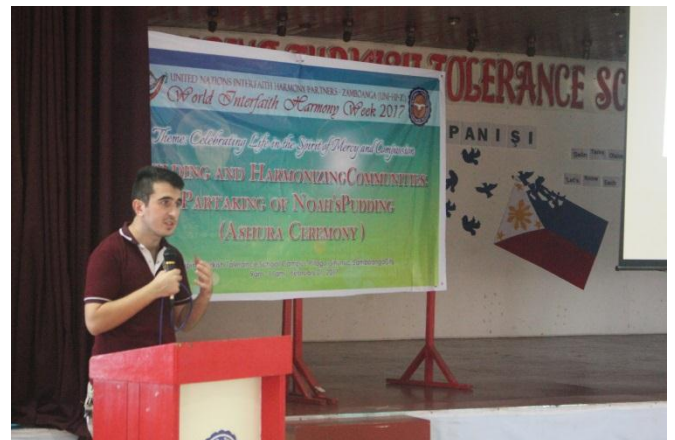
The facilitator gave a short history about the conduct of ASHURA CEREMONY, its purpose and how was it made