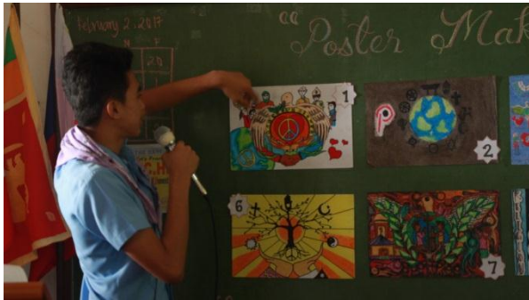
A high school student explaining how he would picture/view WIHW with the theme