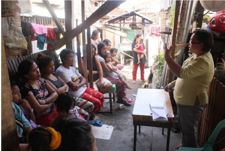
One of the organizers ( right corner ) giving an overview on the celebration of WIHW and in its relationship of caring of the health of one another.