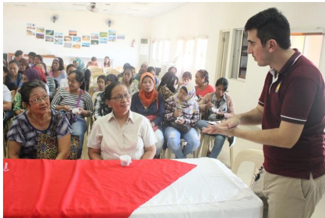
The facilitator explaining the food process to the community with its significance.