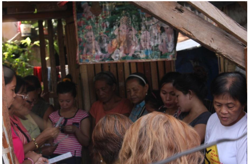
Participants reciting the Harmony Prayer before ending the short gathering.