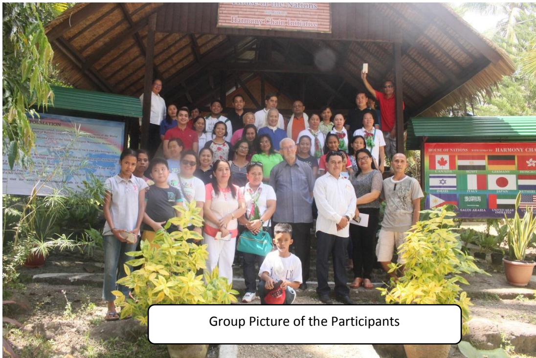
Group Picture of the Participants