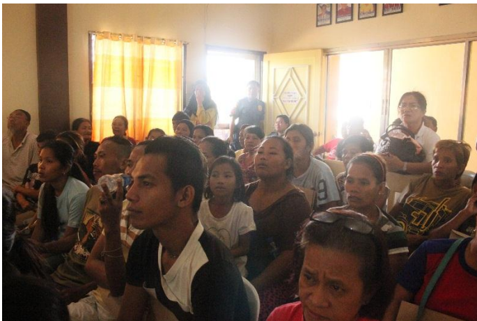
Attendees from Sta. Catalina community