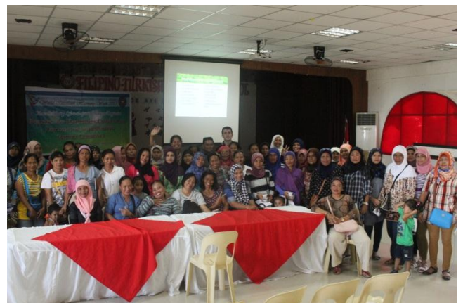
The Filipino – Turkish Tolerance Facilitator and the participants shared a group photo after the event.