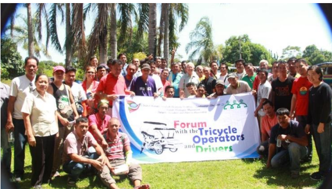
Group picture after the activity.