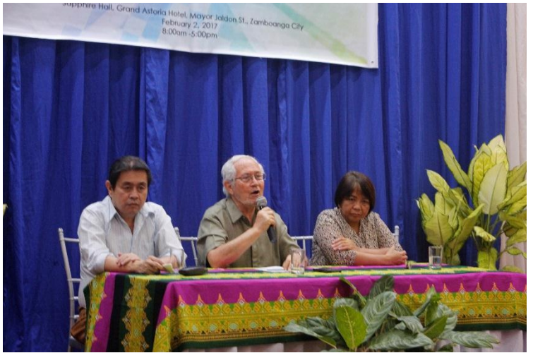
Closing Remarks from the executive Secretary of City Mayor of Zamboanga City