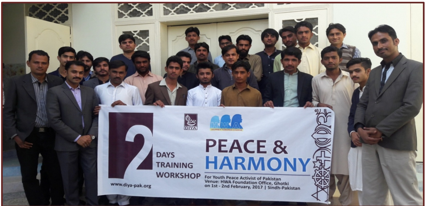
A Group Photo with Training Participants at HWA Foundation Office, Ghotki

The evaluation of the participants indicated that the workshop was successful. To a large extent the objectives of the workshop and expectations of participants were met. The experiences, skills, knowledge and interactive mode of presentation made facilitation friendly and lively. Most of the participants were of the view that the workshop was very relevant to their work.