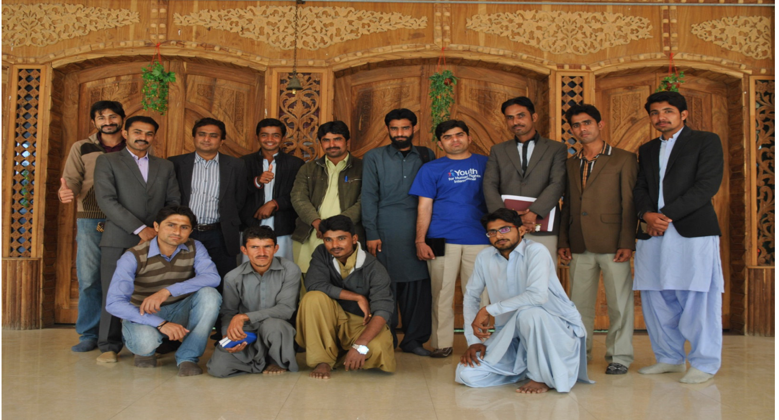
A Group photo of Youth Peace delegates at Kirshina Mandar, Ghotki - Sindh