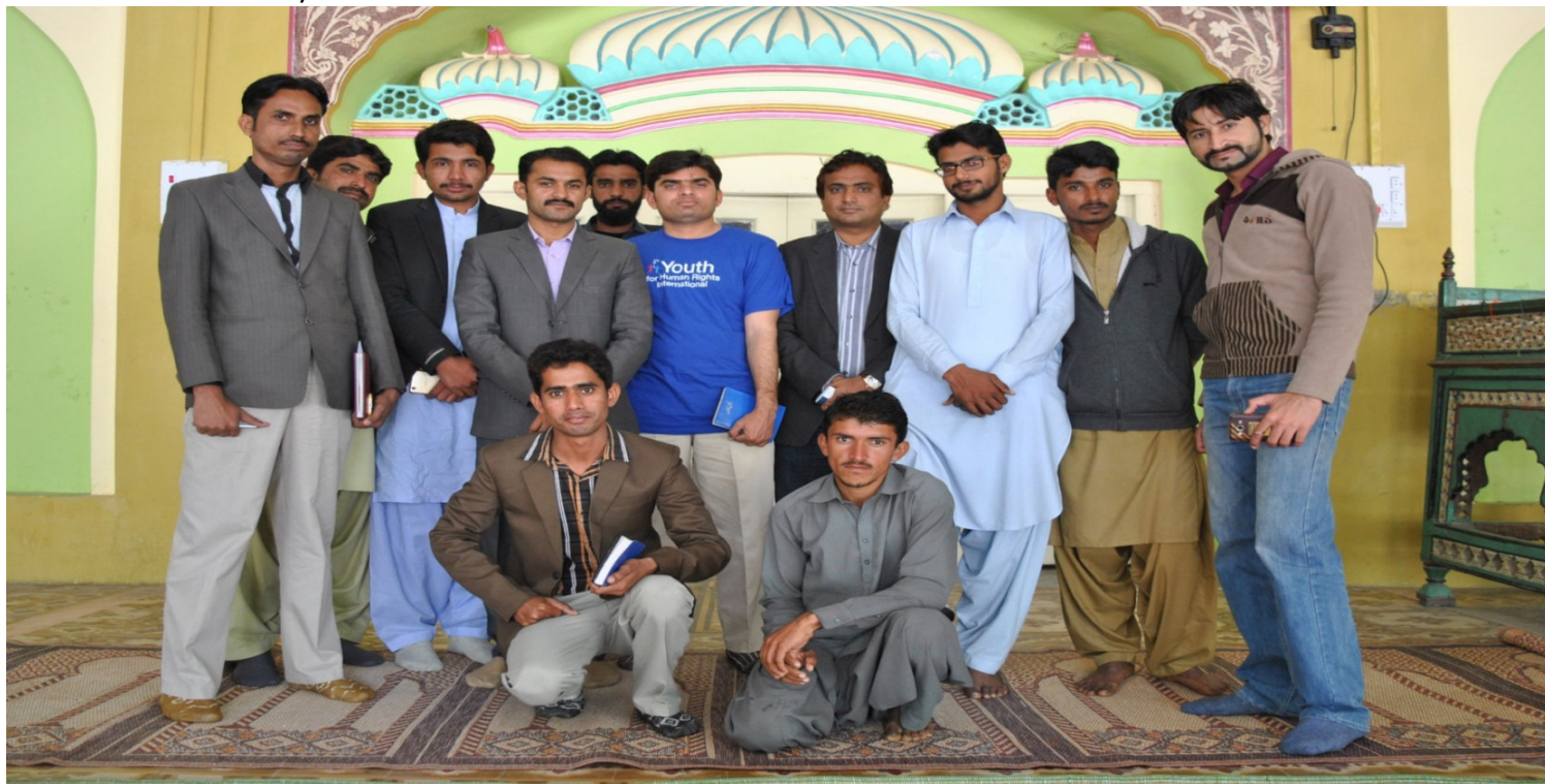
Group photo of Youth Peace Delegation at Jamia Mosque, Ghotki

He was talking about the message 'Allah' our creator. Our Religion is peaceful religions. He said we can live together with each other with love and peace. We are equal human in eye of Allah who is our designer. We can live with peace and love, our lord creator 'Allah' is One, we all have to right spread peace and love with each others. He was telling about the preaching and the message for peace. Each of delegation individuals were happy to saw and heard for peace message from religious scholar. He more said we must study all religions and it is necessary to know in the terms of knowledge. We have served to all humanity without any religion discrimination. He was talking with delegation. I am pleased to see the young peace activist come here to spreading the message of peace and harmony with in different religions. In the last he said I am thankful to Youth peace activist delegation to come here and arranged a great event for spreading the message of peace and harmony.